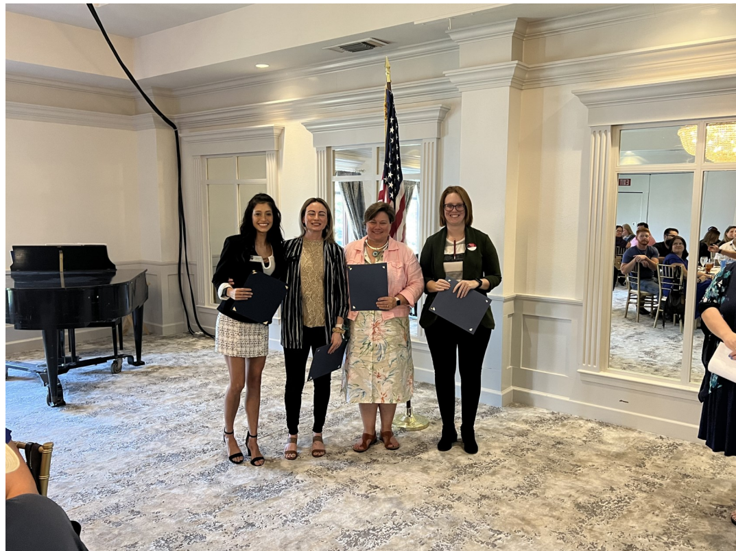
Pictured to the right, are the New Realtors being inducted and re- ceiving their pins.