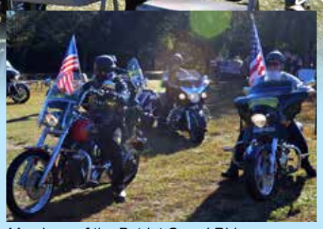
Members of the Patriot Guard Riders