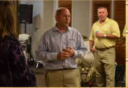
New members from Kays Prestige Kitchens