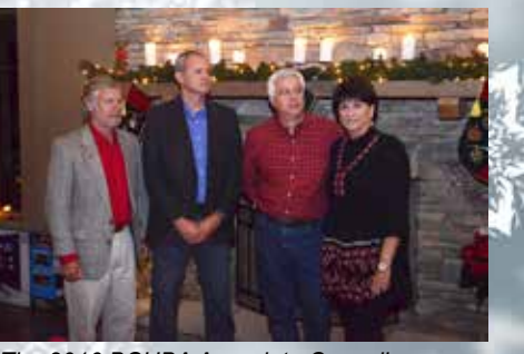
The 2016 BCHBA Associate Council