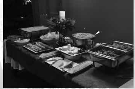
Exquisite food was provided by Wilton's Catering