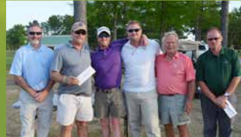
1st place net - D. R. Horton