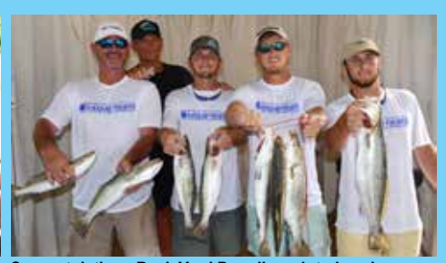
Congratulations Back Yard Paradise - 1st place in Specks and Lunker Speck