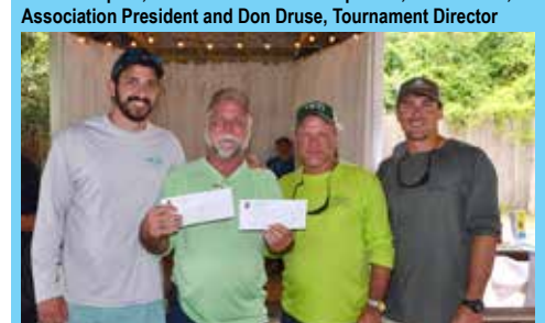
Team Tool Expo - 2nd in Flounder