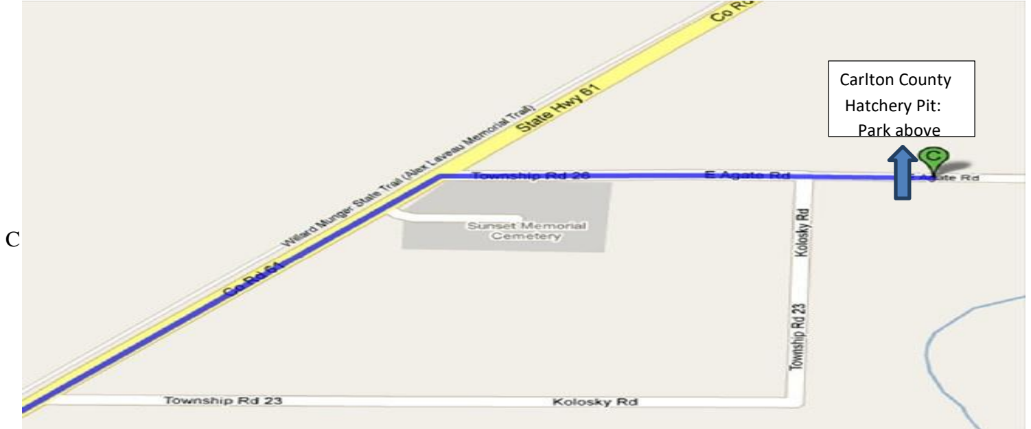
Hatchery Pit (~4 miles from the Chamber office) State Highway 73 north (Arrowhead Lane) to County Highway 61 North to E Agate Road turning just after Sunset Memorial Cemetery. Drive ½ mile to pit entrance and park above, DO NOT drive down into pit.