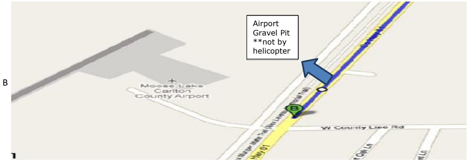
Carlton County Airport Pit (~2 miles from the Chamber office) – County Highway 61 South, right to pit entrance. Look for white sign on tree, it is a small gravel road. Note a small white cross near the entrance on 61. Park in front of barricade, then walk around to enter. DO NOT venture too far to the left as you will be entering Airport property and they may come and tell you to leave.