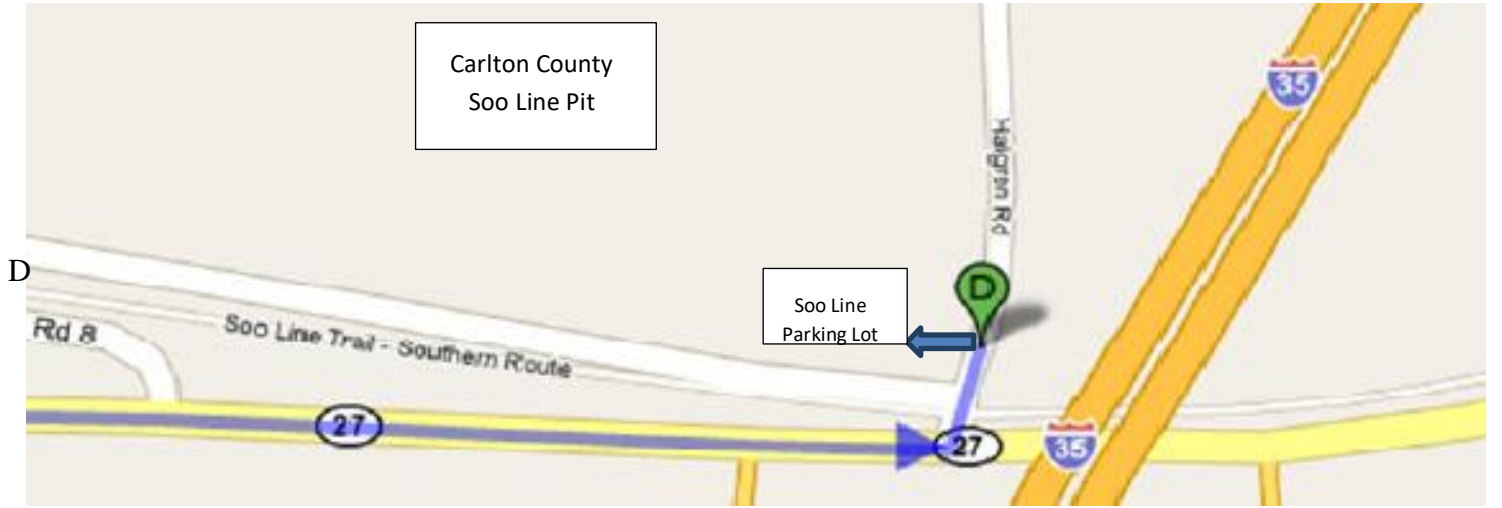
Soo Line Pit – (~2.7 miles from the Chamber office) north on State Highway 73 (Arrowhead Lane) changes to Highway 27 north, left to Halgren Road ~3/4 mile walk to pit entrance. This is the longest walk from parking to the pit. It is about a 10-15 minute walk.