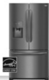
FRENCH DOOR REFRIGERATOR FGHB2668TD (27 CF) Standard Depth FGHF2367TD (22 CF) Counter Depth