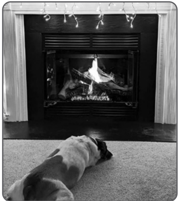
DECEMBER PET PHOTO OF THE MONTH ALL INCLUSIVE CONSTRUCTION