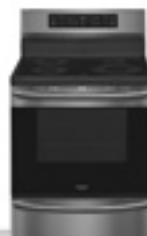
INDUCTION FREESTANDING RANGE FGIF3036TD