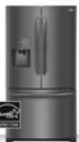
FRENCH DOOR REFRIGERATOR FGHB2667TD (27 CF) Standard Depth FGHD2368TD (22 CF) Counter Depth