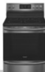
ELECTRIC FREESTANDING RANGE FGEF3036TD FGEF3059TD