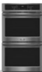
DOUBLE WALL OVEN FGET3065PD (30")