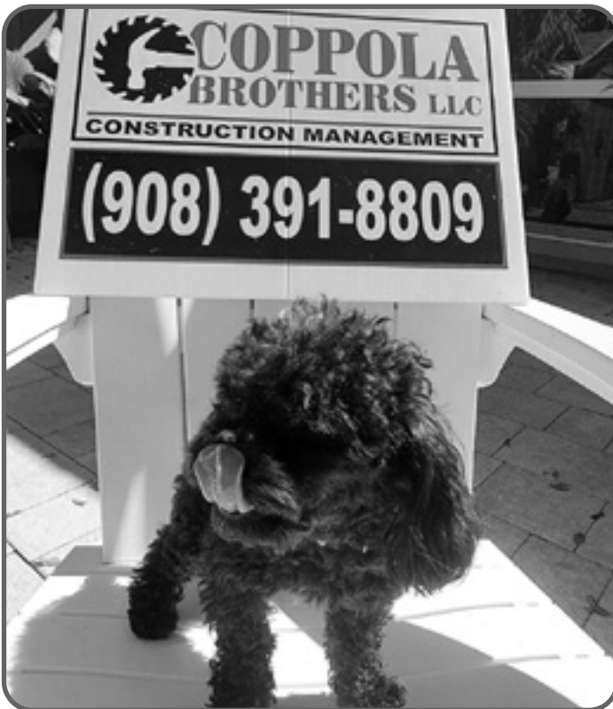
NOVEMBER PET PHOTO OF THE MONTH OLLIE FROM COPPOLA BROTHERS, LLC

at the Fairfield, NJ – Ferguson Bath, Kitchen & Lighting Gallery 65 Passaic Ave Fairfield, NJ 07004 Time - 6:00 PM We look forward to seeing you there!