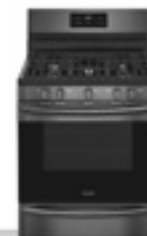
GAS FREESTANDING RANGE FGGF3036TD FGGF3059TD