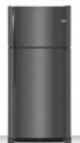
TOP FREEZER REFRIGERATOR FGTR1842TD (18 CF)