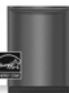
BUILT-IN DISHWASHER FGD2466QD Dark Gray Plastic Tub