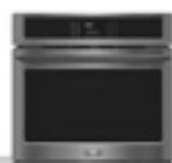
SINGLE WALL OVEN FGEW3065PD (30")