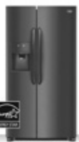
SIDE-BY-SIDE REFRIGERATOR FGSS2635TD (26 CF) Standard Depth FGSC2335TD (22 CF) Counter Depth