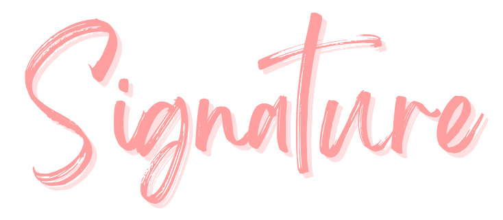
$675 Annual Investment

Designed for small businesses wanting to be actively involved in the Sumter area, increase their network of professional contacts, and relationships, and take advantage of the many marketing and advertising opportunities the Chamber has to offer. Signature level receives all benefits at the Basic level in addition to those listed below.