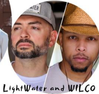
LightWater and WILCO