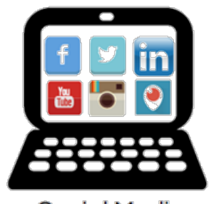
Social Media Exposure