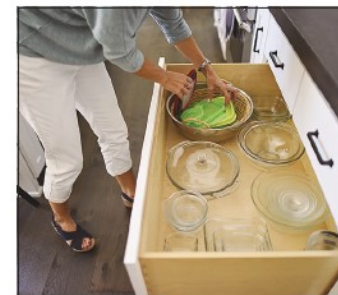
Once you know what sparks joy in your home, you often see clearly what sparks joy in your life.