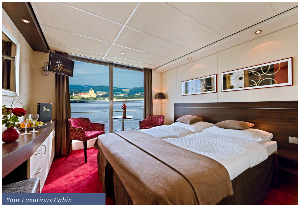
Your Luxurious Cabin

Welcome to your Danube cruise! Transfer to the Amadeus Brilliant, your home for the next 7 nights. Upon embarkation, you will be greeted with a welcome drink. Take some time to familiarize yourself with the ship, before a Welcome Dinner this evening. (D) (Budapest Overnight Stay)