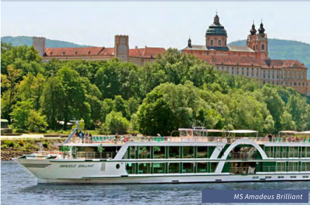
MS Amadeus Brilliant