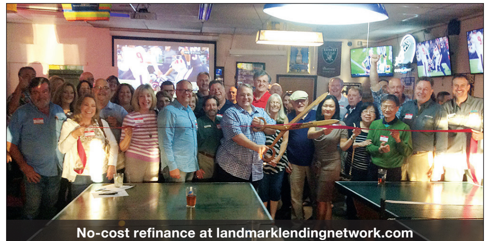
No-cost refinance at landmarklendingnetwork.com

Top Shelf Beauty Bar — Top Shelf is a splendid escape from your day in a bar type atmosphere. Visitors can spend their "happy hour" enjoying the services of our beauty-tenders ranging from eyelash extensions to massage, or spray tans and facials. We have something to satisfy both men and women on our decadent "Bar" menu. A complimentary "juice" bar is located in each treatment room where guests can recharge their electronics while relaxing during their services. Retail therapy is offered with a perfect blend of luxury and wellness products. Please remember to visit our touch up bar before you leave to try the latest trends in cosmetics. Reservations recommended. 925.750.7656 or visit topshelfbeautybar.com