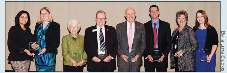
Honorees of the 53rd annual Community Service Awards.

The annual State of the City luncheon is open to the public and will take place Wednesday, February 22, from 12 to 1:30 p.m. To make a luncheon reservation, visit www.pleasanton.org or call the Chamber at (925) 846-5858.