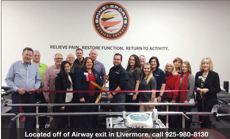
Located off of Airway exit in Livermore, call 925-980-8130

Spine and Sports Physical Therapy — Spine and Sports Physical Therapy has expanded to Livermore, opening its third clinic. We provide physical therapy services to enhance the physical health, fitness and quality of life for our patients. Whether it is post-surgery, athletic injury or orthopedic dysfunction, our therapists are held to the highest of standards and participate in on-going continuing education to ensure our patients receive the most up to date treatment available. We accept most insurances and are located at 2492 Nissen Drive, right off Airway on the freeway in Livermore. Call us to schedule your appointment today (925) 980-8130.