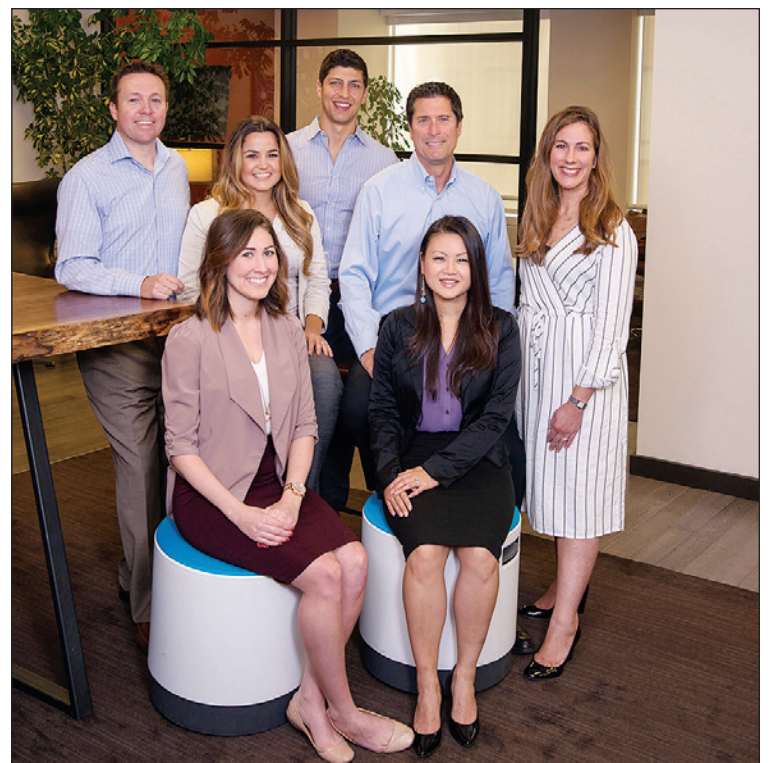
Vista Wealth Management takes on the role as the "Family CFO." They are passionate about knowing their clients.

We use sophisticated asset allocation models based on rigorous academic (Nobel prize winning) research. This not only provides