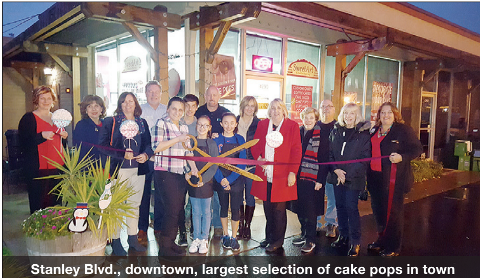
Stanley Blvd., downtown, largest selection of cake pops in town

Club Pilates Pleasanton — We believe Pilates is the finest strength-training workout available for anyone, at any age. It's a path to a fuller, richer, healthier and more satisfying life. The functional strength and flexibility you will gain at Club Pilates won't just benefit you while you're exercising. It will become the key to living a happier, healthier and more fulfilling life. We invite you to Do Pilates. Do Life. Learn more at www.clubpilates.com/location/pleasanton or call 925-255-0880. Club Pilates Pleasanton is located at 6766 Bernal Avenue, Suite 530 in Pleasanton.