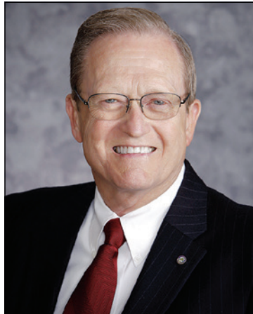
Mayor Jerry Thorne

With elections behind us, it’s time for the mayor and City Council to establish a new list of city-wide priorities, roll up their sleeves and go to work accomplishing as many good things as possible in 2017 and 2018 to ensure Pleasanton remains among the best cities in