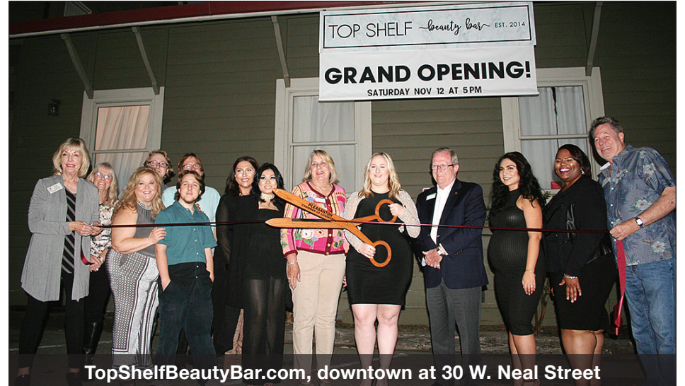
TopShelfBeautyBar.com, downtown at 30 W. Neal Street

Omni Fight Club — Omni Fight Club is excited to be a part of the Tri-Valley community. Our team and efforts are dedicated to community building and creating pathways to a healthy lifestyle for people of all walks of life and fitness levels. We have already coached more than 2,000 workouts in our short time here in Livermore. We bring a vast amount of industry experience and have built a studio to serve all people and goals. Our program is signature kickboxing and weight-training circuits with a new focus every day that is tied together each week/month. We include nutrition, injury prevention and women's self-defense with every membership. We are FUN.TOUGH. FITNESS and we are a complete wellness and fitness studio! Call us today at 925-231-1969 or look us up on Facebook @ Omni Fight Club Livermore and read our reviews and member posts.