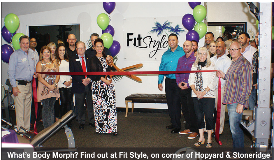
What's Body Morph? Find out at Fit Style, on corner of Hopyard & Stoneridge

Spine and Sports Physical Therapy — Spine and Sports Physical Therapy has expanded to Livermore, opening its third clinic. We provide physical therapy services to enhance the physical health, fitness and quality of life for our patients. Whether it is post-surgery, athletic injury or orthopedic dysfunction, our therapists are held to the highest of standards and participate in on-going continuing education to ensure our patients receive the most up to date treatment available. We accept most insurances and are located at 2492 Nissen Drive, right off Airway on the freeway in Livermore. Call us to schedule your appointment today (925) 980-8130.