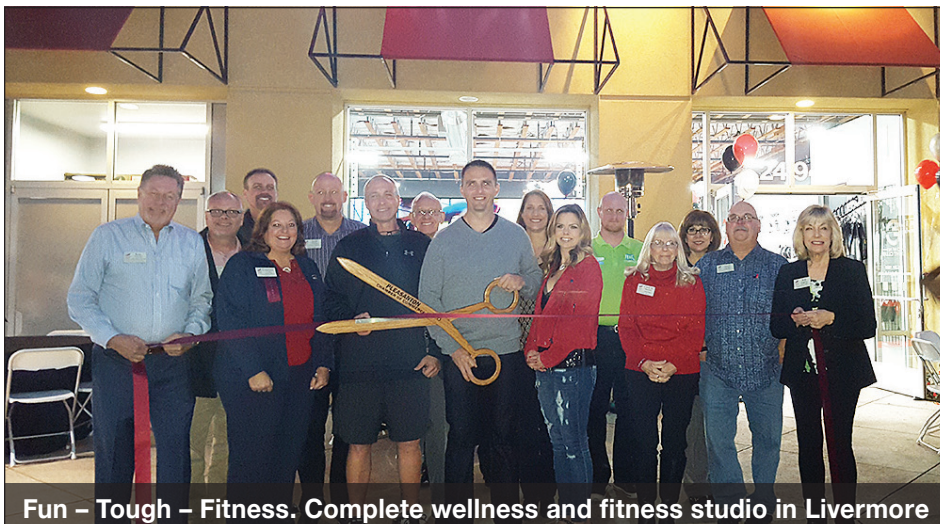
Fun - Tough - Fitness. Complete wellness and fitness studio in Livermore

Fit Style — We just want to give a warm heart-felt THANK YOU to everyone that contributed to making the first year in our new studio a successful one. Fit Style is a local family-owned and operated fitness center that's been involved in the Pleasanton fitness community since 2005. We offer personal training, group HIIT circuit training classes including PiYO, nutrition planning, and a 20 lb. comprehensive weight loss challenge called Body Morph. Give us a call at 925-872-3504 for a free assessment session with a trainer or to try a class! You can also email us at info@fitstyle.com. We are located in the Gateway shopping plaza on the corner of Stoneridge and Hopyard, same parking lot as Chili's and Eddie Papa's. We hope to see you soon!