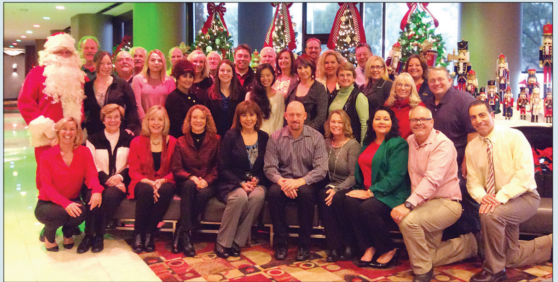
The Ambassador team of 2016 at its annual breakfast in December at the DoubleTree by Hilton Pleasanton at The Club.

The majority of the time you order a drink at one of the monthly mixers, it is an ambassador who serves it to you with a smile! They also volunteer for our annual Community