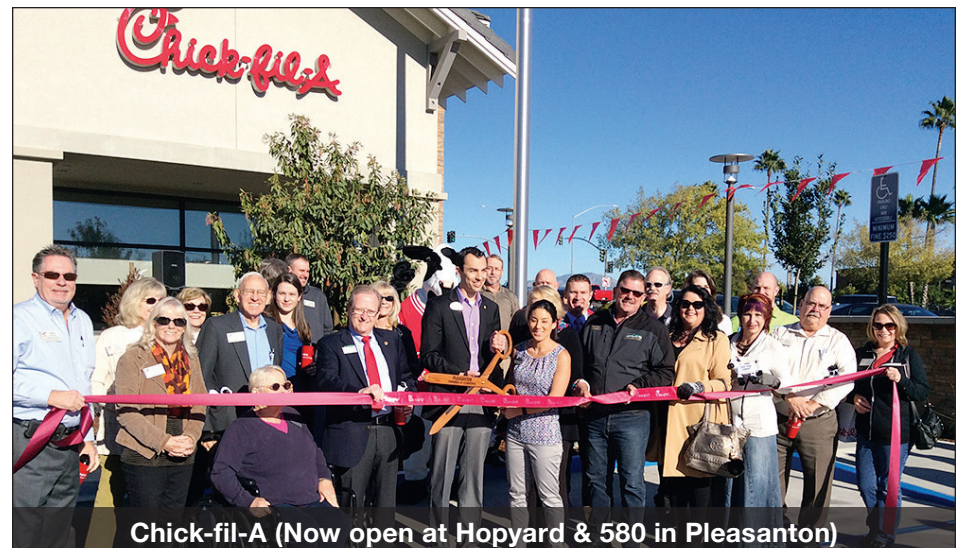
Chick-fil-A (Now open at Hopyard & 580 in Pleasanton)