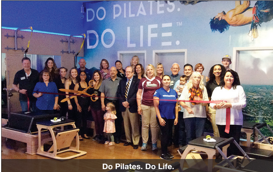
Do Pilates. Do Life.

Club Pilates Pleasanton — We believe Pilates is the finest strength-training workout available for anyone, at any age. It's a path to a fuller, richer, healthier and more satisfying life. The functional strength and flexibility you will gain at Club Pilates won't just benefit you while you're exercising. It will become the key to living a happier, healthier and more fulfilling life. We invite you to Do Pilates. Do Life. Learn more at www.clubpilates.com/location/pleasanton or call 925-255-0880. Club Pilates Pleasanton is located at 6766 Bernal Avenue, Suite 530 in Pleasanton.