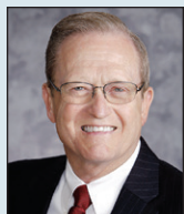
Jerry Thorne Mayor of Pleasanton

The annual State of the City luncheon is open to the public and will take place Tuesday, February 26, from 12 to 1:30 p.m. To make a luncheon reservation, visit www.pleasanton.org or call the Chamber at (925) 846-5858.