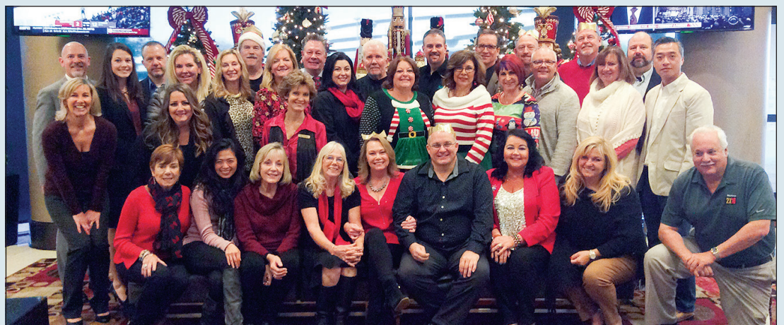
The Chamber's Ambassador committee is instrumental in furthering the Pleasanton Chamber's reputation as one of the most engaging and successful Chambers in the Bay Area.