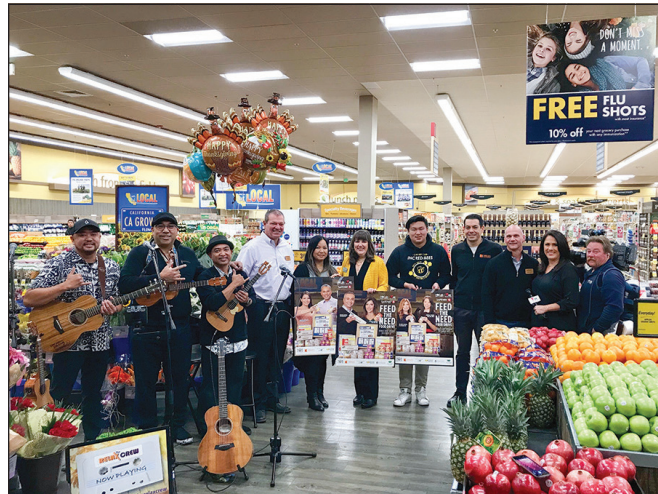
Safeway leadership helps raise awareness to support local food banks during a live news remote at the Bernal Safeway store during the holiday food drive.