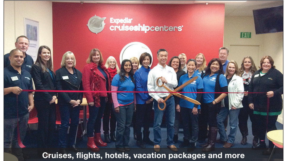
Cruises, flights, hotels, vacation packages and more

Sculptology – Sculptology is the process of making non-invasive body contouring scientific again. To us, body sculpting is more than just a treatment - it's an exciting science! From the moment you walk through the doors of Sculptology and speak with our remarkably skilled providers, see a next generation digital body imaging version of yourself, to the moment you show off your head-turning result, you'll notice the difference and we will be able to measure them. We don't simply offer CoolSculpting - we focus on it exclusively, as it is the catalyst to your wellness-focused lifestyle. It's our belief that when you feel good, you do good, precisely why we refer to our outreach as Sculptology Life. Wellness is so much more than your figure, workout, or diet. We are advocates for total wellness - that of our families, our community, and our world. Call (925)-660-7111 or visit www.sculptology.com to book your complimentary consultation to discover what Sculptology can do for you.