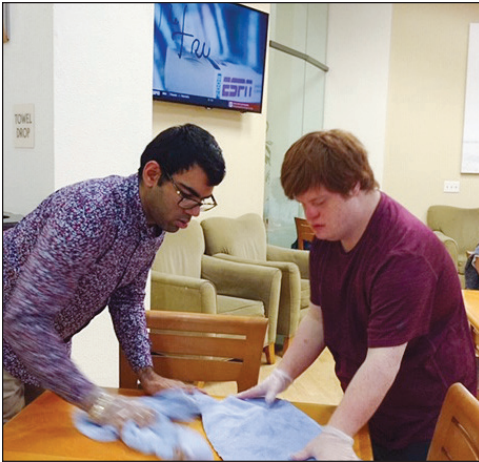
Above: Workability students working at ClubSport in Pleasanton. Right: Adult intern working at central kitchen at Amador Valley High School.