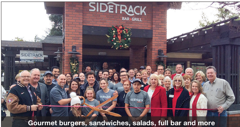
Gourmet burgers, sandwiches, salads, full bar and more

Expedia CruiseShipCenters — I'd like to take this opportunity to give a big Thank You to our community for your support over the year. Of course, to my all consultants, Thank You for your hard work and dedication. Expedia CruiseShipCenters in Pleasanton provides exceptional value and expert advice for travelers booking cruises and vacations. As part of the Expedia, Inc. family of brands, we sell a wide range of vacation products including cruises, flights, hotels, vacation packages, tours, excursions and more. We are located at 4811 Hopyard Road, G-6 in Pleasanton to serve our community. For more information or to research vacation options, visit www.cruiseshipcenters.com/900207 or call (925) 621-8822.