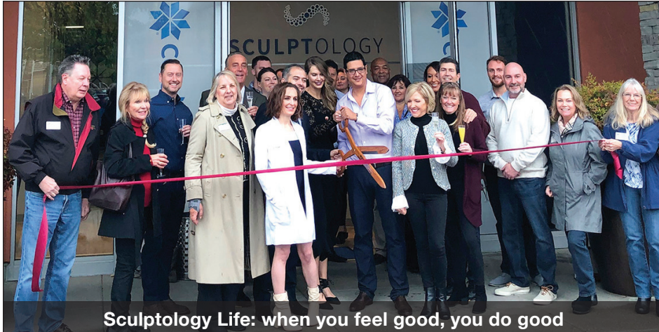
Sculptology Life: when you feel good, you do good

Sculptology – Sculptology is the process of making non-invasive body contouring scientific again. To us, body sculpting is more than just a treatment - it's an exciting science! From the moment you walk through the doors of Sculptology and speak with our remarkably skilled providers, see a next generation digital body imaging version of yourself, to the moment you show off your head-turning result, you'll notice the difference and we will be able to measure them. We don't simply offer CoolSculpting - we focus on it exclusively, as it is the catalyst to your wellness-focused lifestyle. It's our belief that when you feel good, you do good, precisely why we refer to our outreach as Sculptology Life. Wellness is so much more than your figure, workout, or diet. We are advocates for total wellness - that of our families, our community, and our world. Call (925)-660-7111 or visit www.sculptology.com to book your complimentary consultation to discover what Sculptology can do for you.