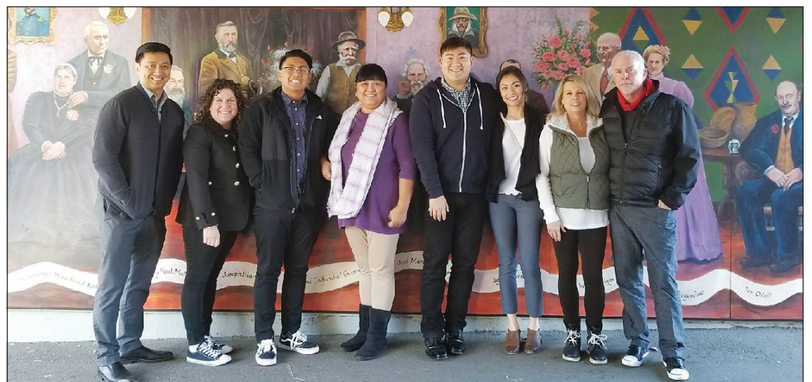
The team at Van Sloten & Laranang CPAs just completed their 30th year in business.