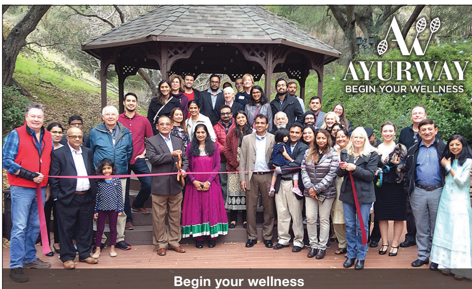
Begin your wellness

Macy's — Macy's Stoneridge celebrated the Grand Opening of their Backstage - a store within a store concept - with the Chamber of Commerce, Cheer SF a local Non-Profit and about 250 customers from the community. At Macy's Backstage, you can experience the thrill of the style hunt with fresh deals and the promise of an ever-changing assortment of merchandise. There's nothing like the fun of finding a really good deal on fashion, home, beauty, toys and more. Off price. On trend. Arriving daily. Visit Macy's Backstage at Stoneridge on the first floor.