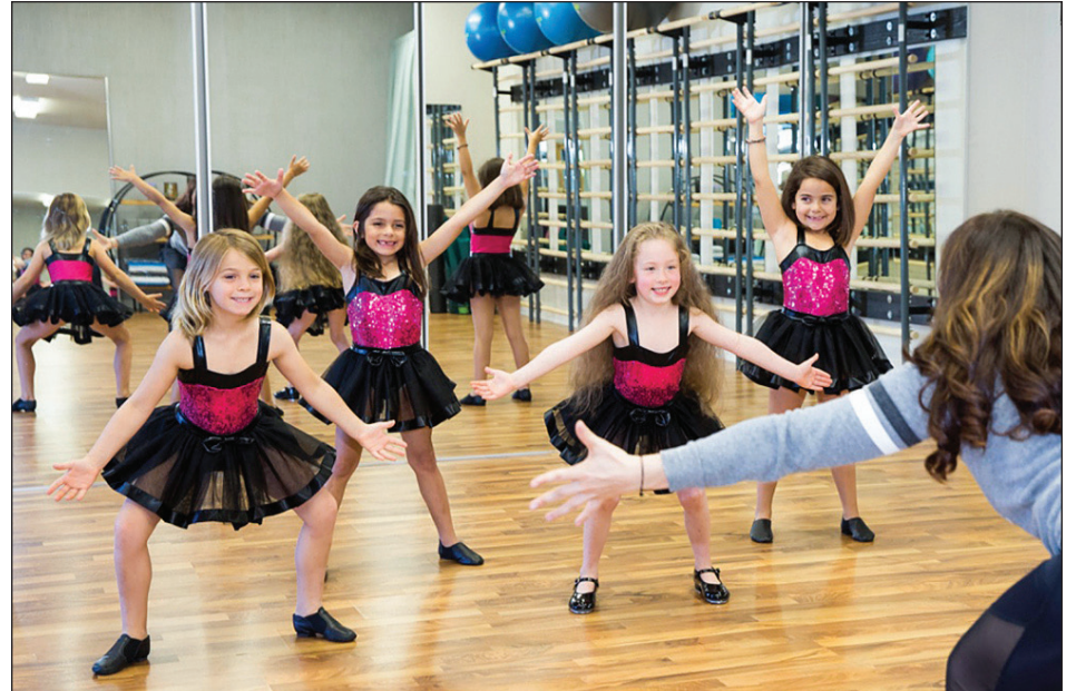
ChoreoBarre®Fitness is offering kids summer dance camps for ages 4-18.