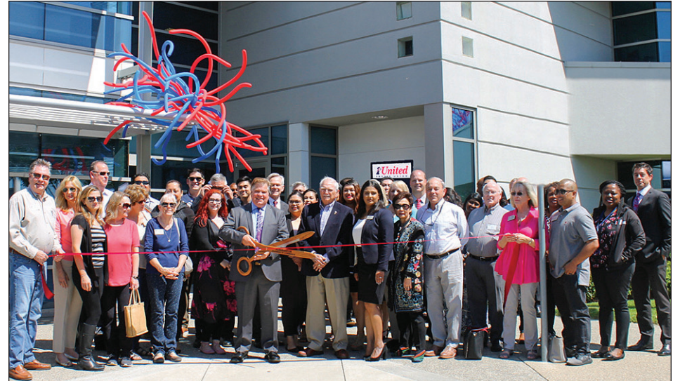
Newly remodeled Pleasanton branch at 5901 Gibraltar Drive

Workday — Workday, a leading provider of enterprise cloud applications for finance and human resources, opened its doors to its new headquarters – 6110 Stoneridge Mall Road in Pleasanton, Calif. It's a new six-story, 410,000 square foot headquarters building, adjacent to the current Workday main campus. It'll house 2,200 employees and includes unique features like a new coffee bar, a café with a 12,000-pound pizza oven, two balconies, and a large 865 kW onsite solar array. Founded in 2005, Workday delivers financial management, human capital management, planning, and analytics applications designed for the world's largest companies, educational institutions, and government agencies. Organizations ranging from medium-sized businesses to Fortune 50 enterprises have selected Workday. Learn more at www.workday.com .