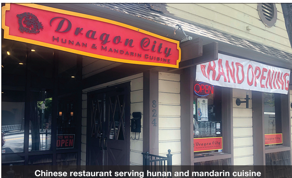
Chinese restaurant serving hunan and mandarin cuisine