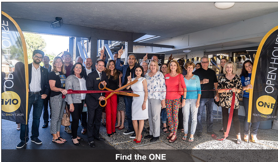
Find the ONE

1st United Credit Union — It doesn't get simpler, faster and friendlier than 1st United Credit Union. As one of the first credit unions in California, 1st United Credit Union was founded in 1932 and has been thriving in the East Bay ever since. Membership is available to anyone who lives, works, or attends school in Alameda, Contra Costa, San Joaquin, Solano, Stanislaus, or Kings counties in California. We believe in local, neighborly banking and hope you will too. Stop by and see us or learn more at 1stunitedcu.org .