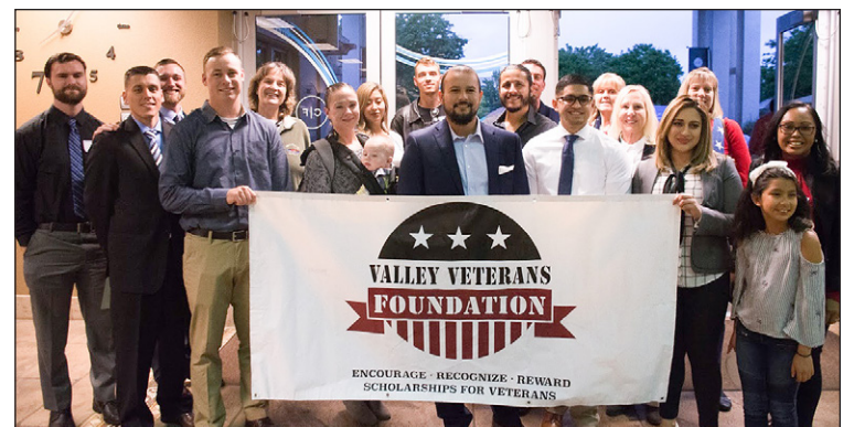
The Valley Veterans Foundation has awarded our returning veterans, active duty and reservists scholarships to continue their educational and career goals.