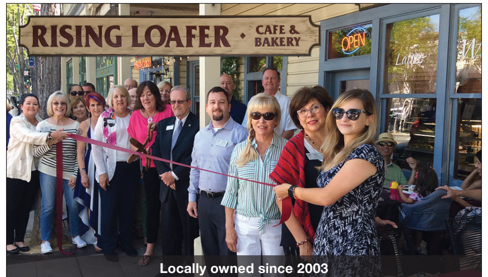
Locally owned since 2003

Realty ONE Group Today — Realty ONE Group is a dynamic, full-service lifestyle Real Estate brand dedicated to empowering and advancing tomorrow's Real Estate, today. Finding a home can be one of the most stressful yet rewarding experiences in your life. Realty ONE Group professional agents understand and work to make the process of buying or selling your house as simple and as exciting as possible. The moment you find your home is as special to us as it is to you. Realty ONE Group agents are set up for success, so they can focus on you. Realty ONE Group Today is located at 601 Main Street in downtown Pleasanton, and learn more at www.rogtoday.com .