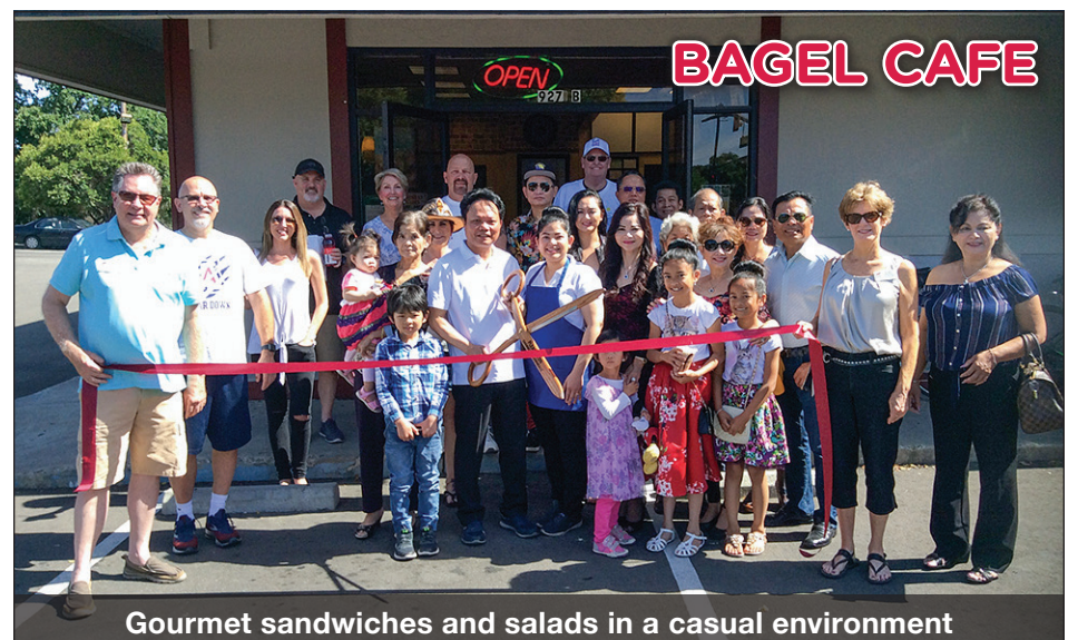
Gourmet sandwiches and salads in a casual environment