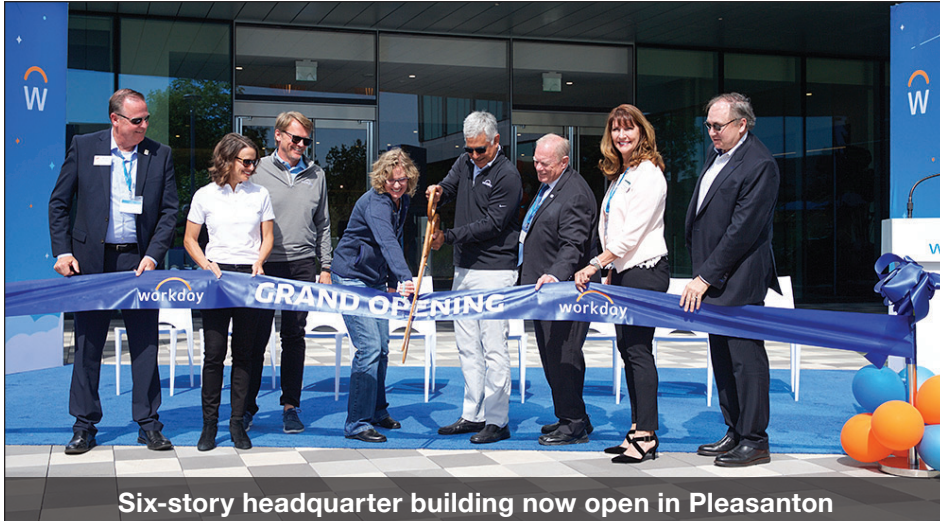
Six-story headquarter building now open in Pleasanton

Workday — Workday, a leading provider of enterprise cloud applications for finance and human resources, opened its doors to its new headquarters – 6110 Stoneridge Mall Road in Pleasanton, Calif. It's a new six-story, 410,000 square foot headquarters building, adjacent to the current Workday main campus. It'll house 2,200 employees and includes unique features like a new coffee bar, a café with a 12,000-pound pizza oven, two balconies, and a large 865 kW onsite solar array. Founded in 2005, Workday delivers financial management, human capital management, planning, and analytics applications designed for the world's largest companies, educational institutions, and government agencies. Organizations ranging from medium-sized businesses to Fortune 50 enterprises have selected Workday. Learn more at www.workday.com .