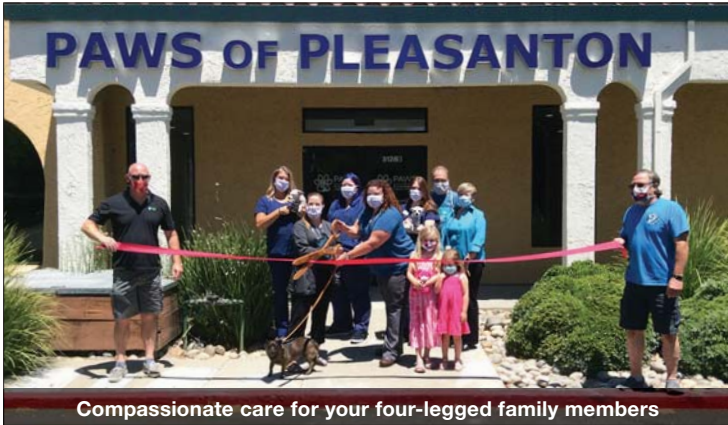
Compassionate care for your four-legged family members