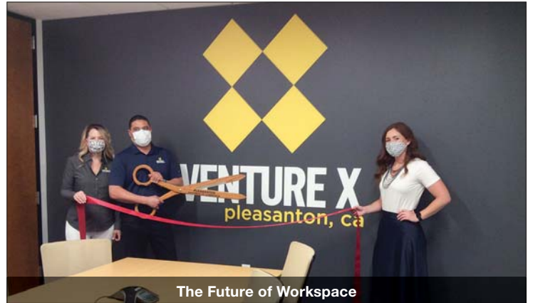
The Future of Workspace