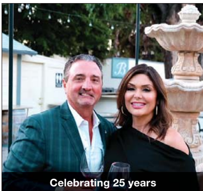
Celebrating 25 years

Valley Veterans Foundation — Valley Veterans Foundation celebrated a check presentation with a ribbon cutting ceremony. Valley Veterans Foundation is a non-profit 501(c)3 organization providing financial support and resources for military personnel and veterans pursuing post-secondary education. Valley Veterans Foundation was incorporated in 2007 when community members realized there was a lack of information and assistance for veterans to acquire needed resources for successfully transitioning back into civilian life. VVF scholarships and activities are designed to help Tri-Valley veterans embark upon career paths with training, skills and resources necessary to become personally and professionally successful members of their communities. Learn more at www.valleyveteransfoundation.org .