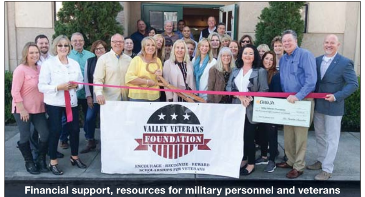
Financial support, resources for military personnel and veterans

Porky's Pizza Palace — Porky's Pizza Palace celebrated its one-year anniversary in Pleasanton with a tribute event in March, including large cheese pizzas for $1 as well as specialty cocktails and drink specials. Today, Porky's Pizza Palace in Pleasanton is a favorite spot among many Tri-Valley citizens, and those who are pizza lovers from all over the East Bay. Porky's was first founded in 1963 by the Marrone family, becoming a premier spot in the Washington Manor area of San Leandro. Porky's was purchased in 1983, by the elder Valenziano family, upon moving from Illinois. Porky's Pizza Pleasanton opened its patio for outdoor dining on June 19, and is following all health and safety requirements. Opening at 10:45 a.m. every day, visit Porky's at 2911 Hopyard Road in Pleasanton.