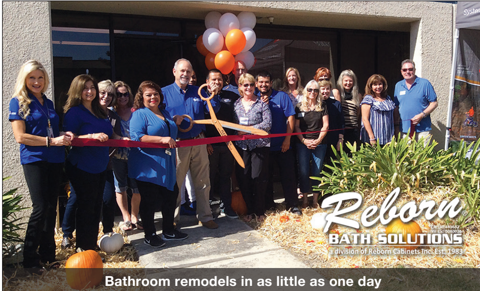
Bathroom remodels in as little as one day

Reborn Bath Solutions — Reborn Bath Solutions is excited to announce our showroom is open and ready for business. We are happy to offer a number of bathroom renovation options to best suit your need. Offering several affordable, long-lasting products that can increase the beauty and accessibility of your bathroom in as little as one day. Specializing in low entry showers, tub to walk-in shower conversion and walk-in tubs. Call today to schedule your free In-Home consultation at 888-273-2676, like us on Facebook, or visit our website at www.rebornbathsolutions.com . We are located at 7087 Commerce Circle, Suite A in Pleasanton.