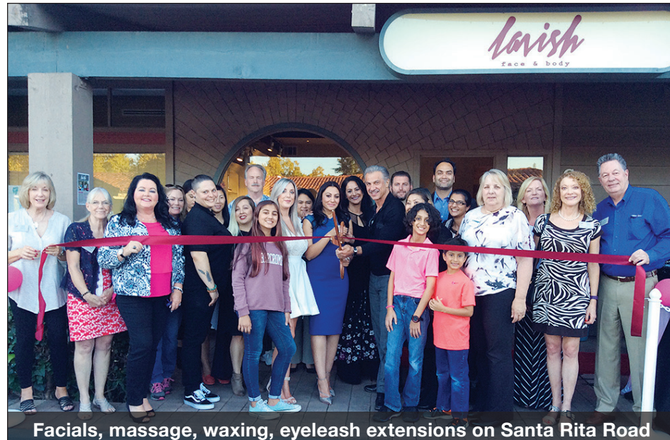
Facials, massage, waxing, eye lash extensions on Santa Rita Road

Experience Burma Restaurant & Bar — It is our long-awaited pleasure to bring flavorful Burmese Cuisine to Pleasanton and the nearby Tri-Valley area. Burmese Cuisine embodies the cultural mix, spiced with rich flavors from countries such as China, India, and Thailand, along with its own unique qualities. We plan to entertain guests with unique Burmese culture and the top-quality food. Open seven days a week for catering, lunch, dinner and take-out. We are located at 600 Main Street, Unit G, aka 221 Division Street since the main entrance is on Division street. Please check out our website for our menu, hours and about us at www.theexperienceburma.com or call us at (925) 398-8219. We will be delighted to see you soon.