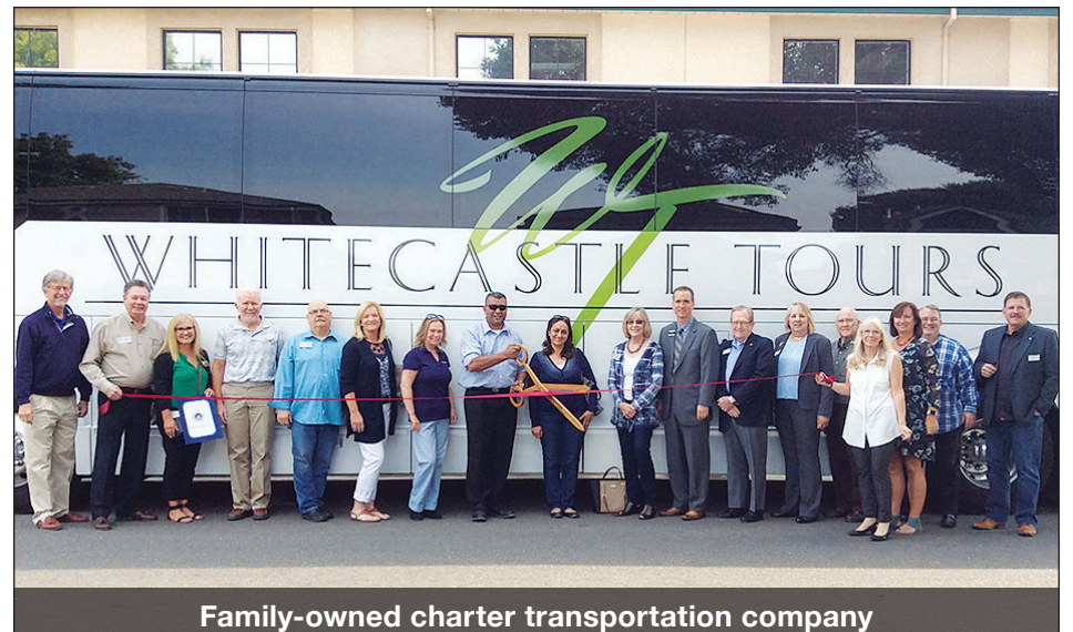
Family-owned charter transportation company

Boulevard — The Welcome Haus, Boulevard's information center, is where you can explore and learn all about this innovative new master planned community in Dublin. Conveniently located near the 580 and 680 expressways and walkable to BART, Boulevard offers homebuyers urban conveniences along with the comforts of a suburban neighborhood. We invite you to stop by the Welcome Haus and explore the three new home neighborhoods by Brookfield Residential and CalAtlantic Homes, visualize our community thru interactive displays, experience our future Rec Center through virtual reality, learn about our 15 planned themed pocket parks and so much more. For more information, visit www.BlvdDublin.com or call 925-314-4068.