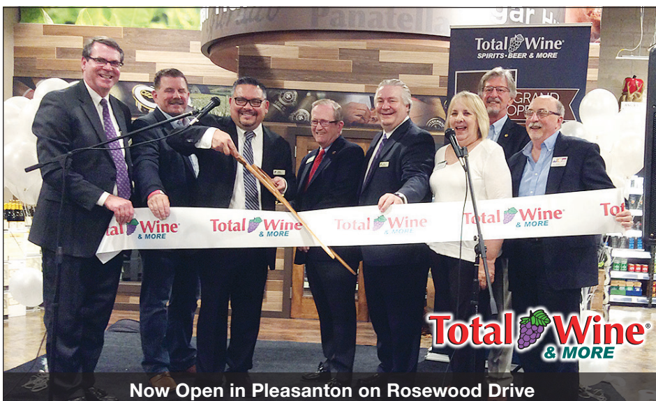
Now Open in Pleasanton on Rosewood Drive

Whitecastle Tours — Whitecastle Tours, Inc. is a family owned and operated Charter Transportation Company in the East Bay Area. We bring the local community our high standard of excellence in safety, comfort, affordability, and reliability. We carry 50+ passenger vehicles as well as 27-passenger vehicles. Please contact us for your transportation needs and mention this ribbon cutting photo to receive a 10% discount. Our office is located at 6111 Southfront Road Suite G in Livermore. Check out our website www.whitecastletours.com or give us a call at 925-743-1963.