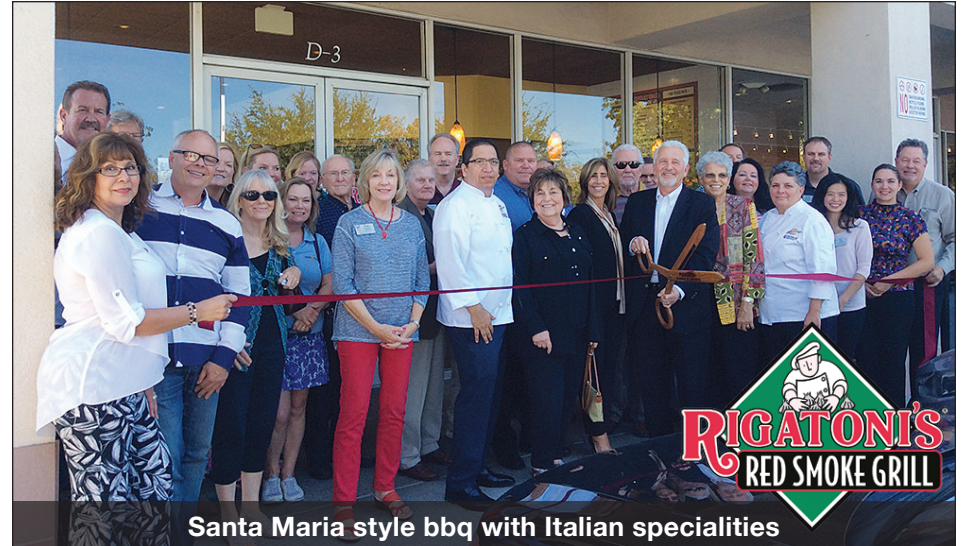
Santa Maria style bbq with Italian specialties

Reborn Bath Solutions — Reborn Bath Solutions is excited to announce our showroom is open and ready for business. We are happy to offer a number of bathroom renovation options to best suit your need. Offering several affordable, long-lasting products that can increase the beauty and accessibility of your bathroom in as little as one day. Specializing in low entry showers, tub to walk-in shower conversion and walk-in tubs. Call today to schedule your free In-Home consultation at 888-273-2676, like us on Facebook, or visit our website at www.rebornbathsolutions.com . We are located at 7087 Commerce Circle, Suite A in Pleasanton.