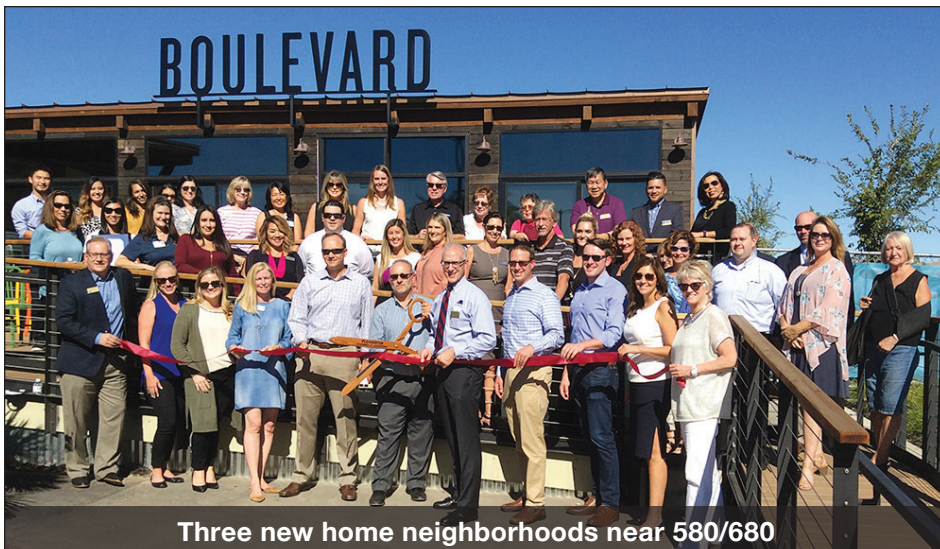
Three new home neighborhoods near 580/680

Rigatoni's Red Smoke Grill — A quick, casual restaurant where the central California coast meets Tuscany. Experience the flavors of Santa Maria Style BBQ with Italian specialties. Rigatoni's Red Smoke Grill specializes in pan-tossed pasta to order, Santa Maria Style Tri-Tip, Rotisserie Chicken, Slow Roasted Pulled Pork and BBQ St Louis Ribs. They also have a great selection of Burgers, Sandwiches and Salads. Need catering for your next event or meeting? Catering specialists can help plan the perfect menu! Order online to go or delivery. Learn more at www.RigatonisRedSmokeGrill.com or call 925-734-0307 for more information. Rigatoni's Red Smoke Grill is located at 4501 Hopyard Road in Pleasanton.