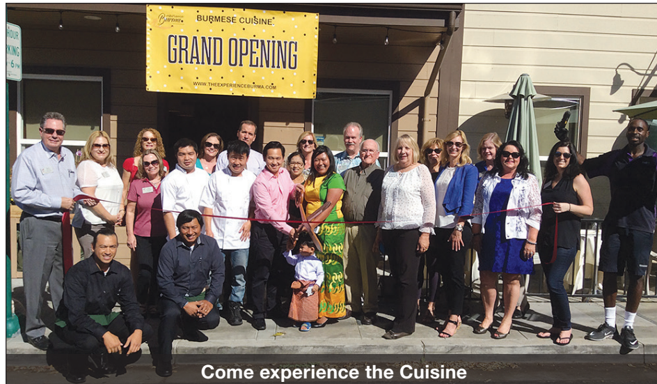
Come experience the Cuisine

Experience Burma Restaurant & Bar — It is our long-awaited pleasure to bring flavorful Burmese Cuisine to Pleasanton and the nearby Tri-Valley area. Burmese Cuisine embodies the cultural mix, spiced with rich flavors from countries such as China, India, and Thailand, along with its own unique qualities. We plan to entertain guests with unique Burmese culture and the top-quality food. Open seven days a week for catering, lunch, dinner and take-out. We are located at 600 Main Street, Unit G, aka 221 Division Street since the main entrance is on Division street. Please check out our website for our menu, hours and about us at www.theexperienceburma.com or call us at (925) 398-8219. We will be delighted to see you soon.