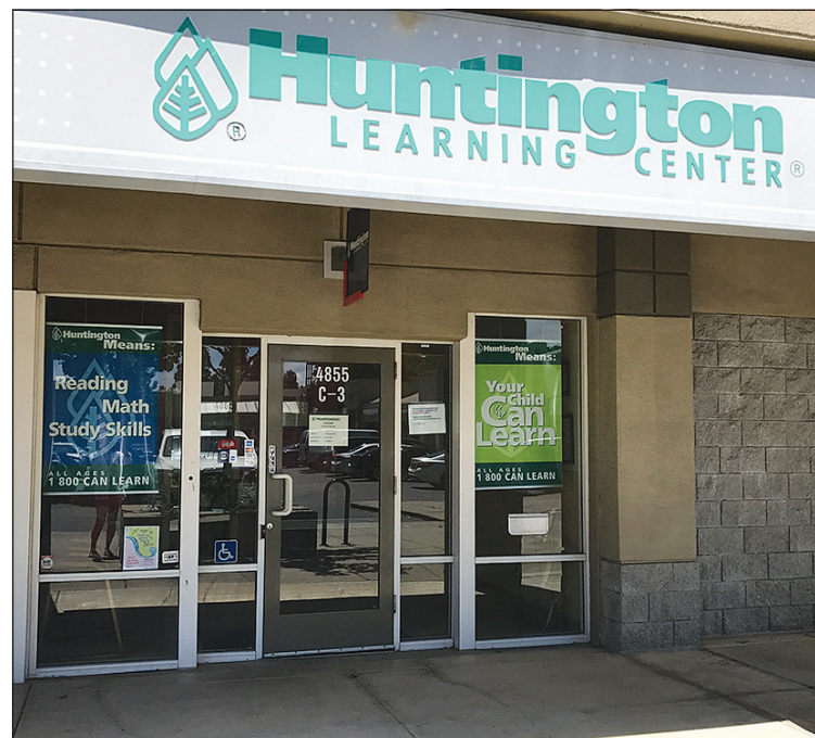
Huntington Learning Center is located at 4855 Hopyard Road in Pleasanton.

Seeing kids succeed and realizing their potential! At Huntington Learning Center, we understand that one size does not fit all stu-