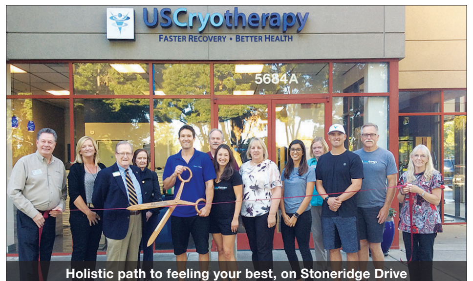
Holistic path to feeling your best, on Stoneridge Drive

Total Wine & More — Total Wine & More is now open at 4225 Rosewood Drive. With unmatched service, selection, and price, Total Wine & More is the nation's largest independent wine retailer with over 8,000 wines, 3,000 spirits, and 2,500 beers. With over 160 stores nationwide, including over 20 in California, we are also committed to giving back to the local community. During our grand opening weekend (Oct 26-29th), Total Wine donated a portion of our wine sales to the Museum on Main in Pleasanton. We look forward to serving you! Learn more at www.totalwine.com .