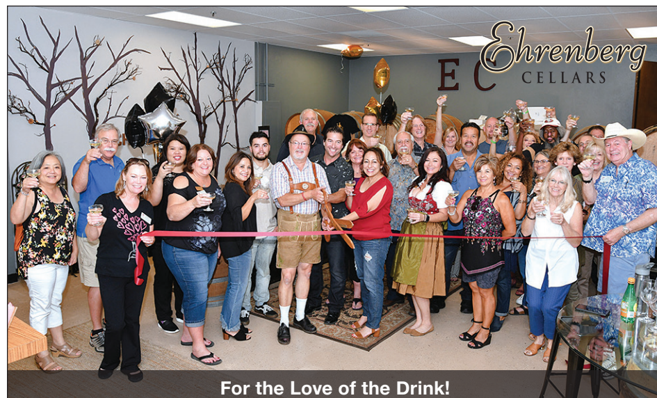
For the Love of the Drink!

Créatif — Créatif is the new way to experience ART, for kids and adults. Conveniently located near Downtown Pleasanton, Créatif offers customers many ways to explore their artistic talents. Join Créatif for a paint-your-own art session, celebrate your special event in our private party room or learn to draw and paint at a fun art class. Créatif offers a variety of painting surfaces such as ceramic, canvas, rock, pottery and unfinished wood. If you need a little inspiration, the ArtPad tutorials and images can guide you in creating your own unique artwork. Créatif is redefining an Art Studio by integrating technology and art. Créatif aspires to become an integral part of our customer's meaningful experiences, their artistic development and their cherished memories. For more information, visit www.creatif.com or call at 925-500-8315. Come and be a part of the excitement. Créatif is located at 5480 Sunol Blvd. #2 in Pleasanton.