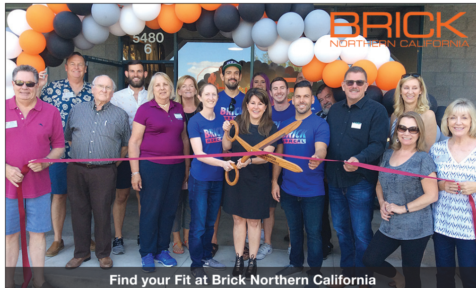
Find your Fit at Brick Northern California

Hairlights Salon — Hairlights Salon & Barbershop is a Paul Mitchell focus salon catering to men, women, and children. Hairlights specializes in cutting, color, balayage, highlights, ombre, perms, keratin smoothing treatments, make up, facial waxing and special occasion styling and is excited to be celebrating its 15th year of doing business in Pleasanton. Hairlights Salon & Barbershop is located at 4307 Valley Avenue, Suite F in Pleasanton. Contact Hairlights at 925-462-HAIR (4247) or online at www.hairlightssalon.com .