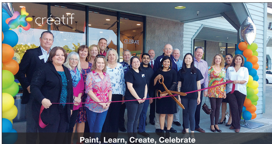
Paint, Learn, Create, Celebrate

Brick NorCal — Brick NorCal offers a wide variety of classes, including CrossFit, HIIT, strength & conditioning, yoga, mobility and pilates; all in a non-intimidating, inclusive and safe environment where you can have fun, while achieving your fitness goals. The gym features top-of-the-line equipment, showers, FloWater, towel service, protein shakes and a coffee bar, all in a clean and air-conditioned environment. Located at 5480 Sunol Blvd. Suite 6-9 in Pleasanton, Brick invites you to try them out with a one-week free trial. Call today at 925-400-0004 or visit them online at www.brick.fit/northerncalifornia .