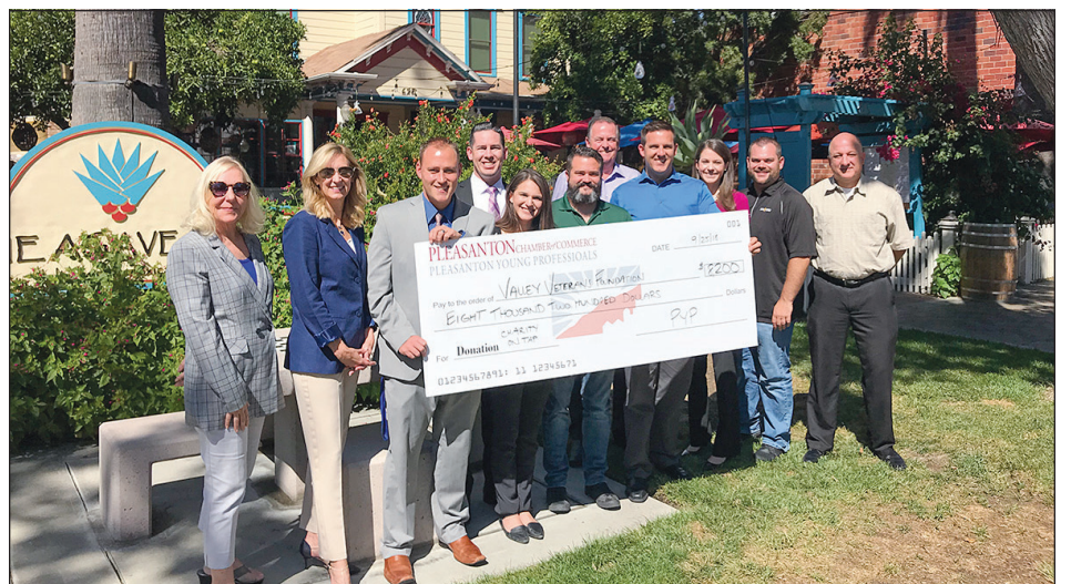
Members of the Pleasanton Young Professionals presented the Valley Veterans Foundation a check for $8,200.

The Pleasanton Young Professionals is a sub-group of the Pleasanton Chamber of Commerce, giving emerging professionals opportunities to learn and grow through networking, leadership opportunities, and community service.