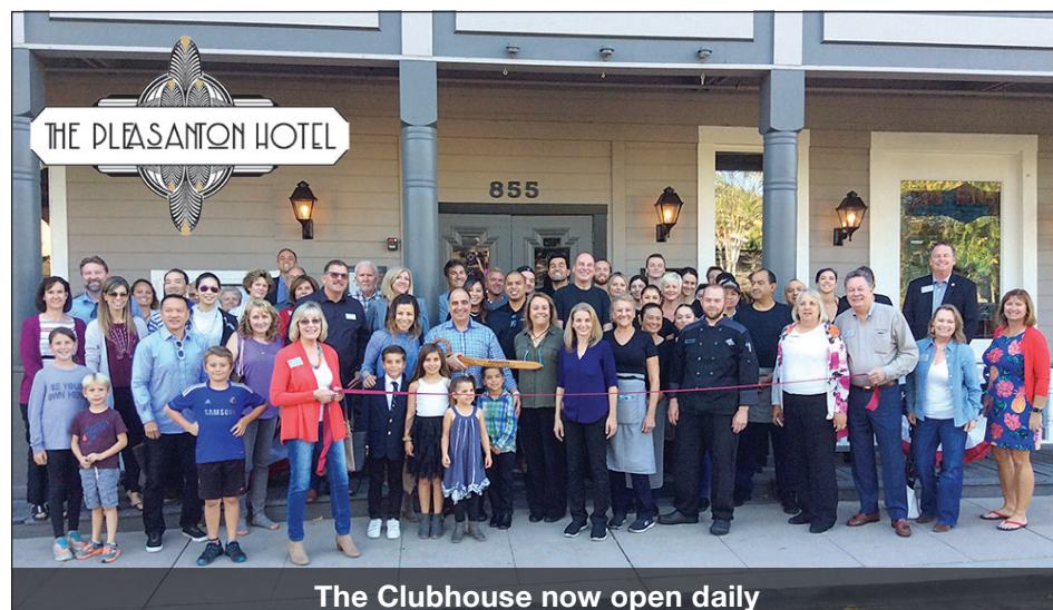
The Clubhouse now open daily

JINYA Ramen Bar — Anyone from Japan can tell you: Real Japanese ramen isn't about the noodles, it's about the broth. That's why JINYA Ramen Bar's signature stocks take center-stage on our menu. Slowly simmered for more than 10 hours, we combine whole pork bones, chickens or vegetables with just the right amount of bonito, dashi, kombu and other authentic ingredients. The result is a rich broth that is thick, full-flavored, healthful... and unforgettable. However, we believe that there's still more to ramen than broth. We take our noodles seriously, too. Meticulously aged for three days to maximize their flavor, JINYA Ramen Bar's noodles are made fresh daily and crafted to sink perfectly in your bowl with thick noodles for some broths and thin noodles for others. Welcome to JINYA, a bowl above all others. Now open in the Pacific Pearl Shopping Center at 2693 Stoneridge Drive in Pleasanton.