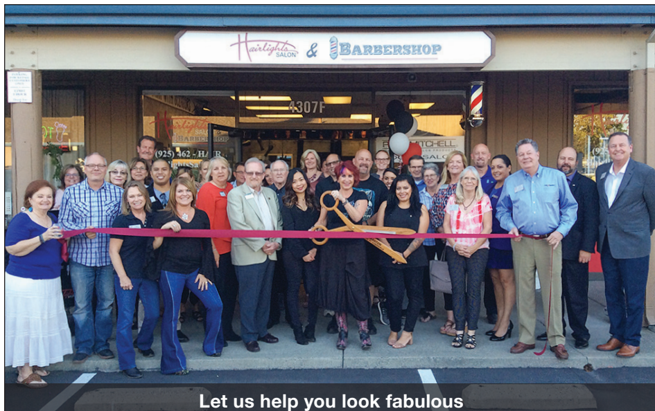
Let us help you look fabulous

Hairlights Salon — Hairlights Salon & Barbershop is a Paul Mitchell focus salon catering to men, women, and children. Hairlights specializes in cutting, color, balayage, highlights, ombre, perms, keratin smoothing treatments, make up, facial waxing and special occasion styling and is excited to be celebrating its 15th year of doing business in Pleasanton. Hairlights Salon & Barbershop is located at 4307 Valley Avenue, Suite F in Pleasanton. Contact Hairlights at 925-462-HAIR (4247) or online at www.hairlightssalon.com .