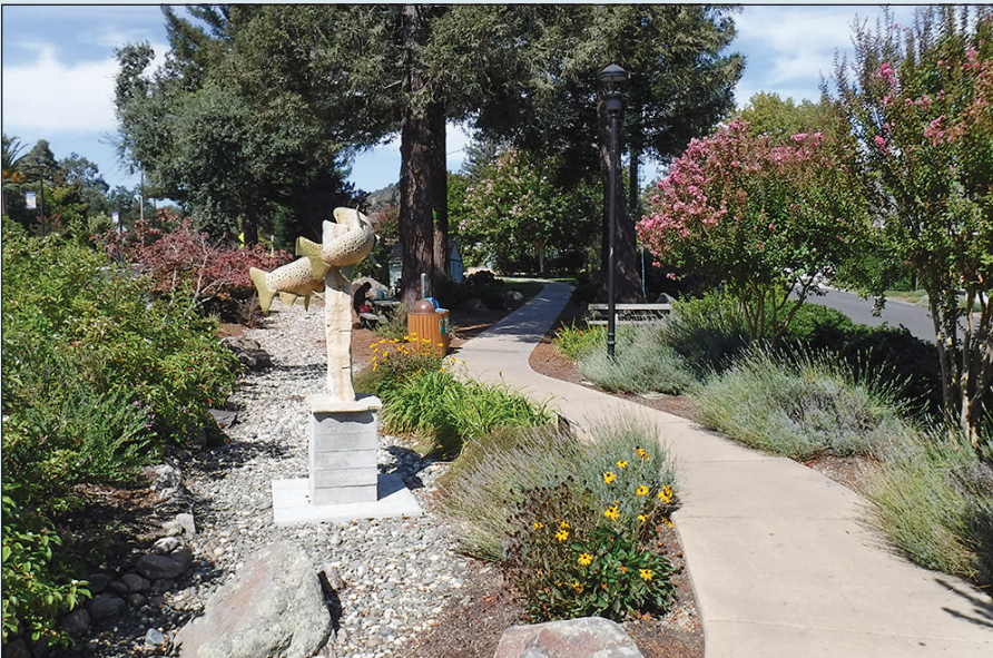
The concept of a Cultural Arts Park, possibly similar to above, is in the beginning stages of planning and ideas are being requested from the public.