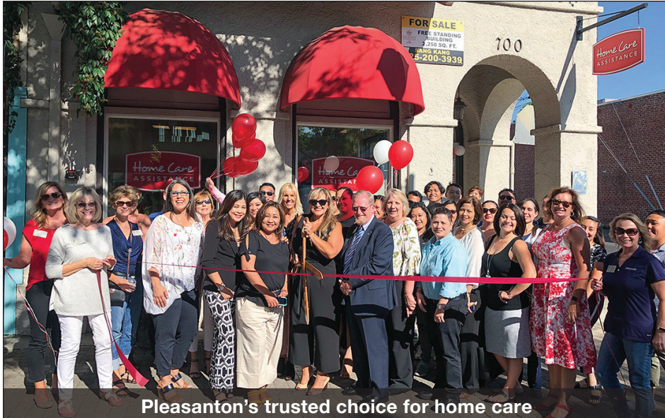
Pleasanton's trusted choice for home care

Home Care Assistance — At Home Care Assistance, we provide customized care to older adults so they can live happier, healthier lives at home. We champion the needs of seniors with a positive, empowering approach to aging that celebrates independence, dignity and quality of life. Our caregivers receive exceptional training, support and resources to deliver an unmatched care experience. Come talk to our care team at 700 Main Street in downtown Pleasanton, call us at 925-954-4838 or visit HomeCareAssistance.com/Pleasanton to learn more.