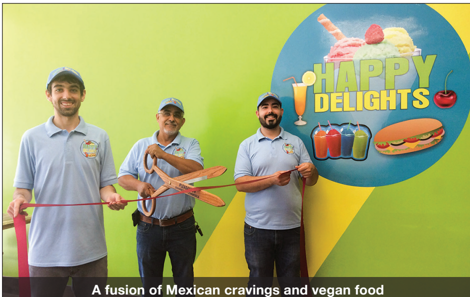
A fusion of Mexican cravings and vegan food