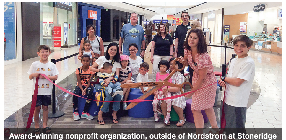
Award-winning nonprofit organization, outside of Nordstrom at Stoneridge

Happy Delights — A new concept from the owners of Rancho Grande Taqueria, and located just a few doors down at 2771 Hopyard Road in Pleasanton, Happy Delights is now open. A fusion of Mexican cravings and vegan food, Happy Delights is serving healthy vegetable and fruit juices, salads, smoothies, ice cream, and more. Happy Delights had its grand opening celebration at the end of August, complete with mariachis. They also donated 20% of their proceeds from the grand opening to Sandra J. Wing Healing Therapies Foundation. Call Happy Delights at 925-425-7464.