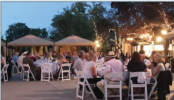
Barone's Backyard is the site of the Red, White and You Gala, which is a night of dinner, dancing, a live band and silent auction.