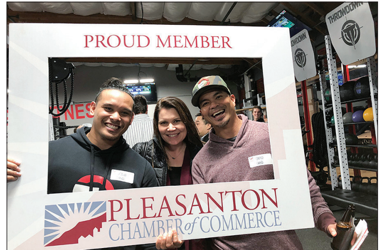
Omni Fight Club Pleasanton has been a member of the Pleasanton Chamber since March of 2018 and hosted the Chamber's January 2019 networking mixer.

We are excited to announce our annual Economic Development Event on Tuesday, October 29, 2019 where the Chamber will be promoting local businesses through innovation and entrepreneurship. This event is a partnership with the City of Pleasanton, where economic driver awards are presented to dynamic companies headquartered in Pleasanton. The 2019 event will feature a fresh spin and focus on women in business with a very dynamic keynote speaker. We need to celebrate the amazing women business leaders in our community. This will be a fantastic event – learn more at www.pleasanton.org .