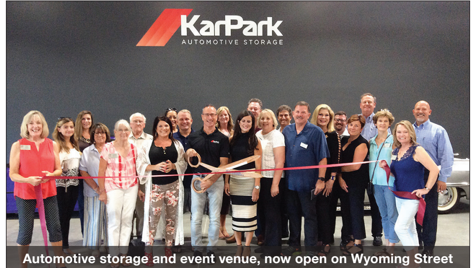
Automotive storage and event venue, now open on Wyoming Street

Home Care Assistance — At Home Care Assistance, we provide customized care to older adults so they can live happier, healthier lives at home. We champion the needs of seniors with a positive, empowering approach to aging that celebrates independence, dignity and quality of life. Our caregivers receive exceptional training, support and resources to deliver an unmatched care experience. Come talk to our care team at 700 Main Street in downtown Pleasanton, call us at 925-954-4838 or visit HomeCareAssistance.com/Pleasanton to learn more.