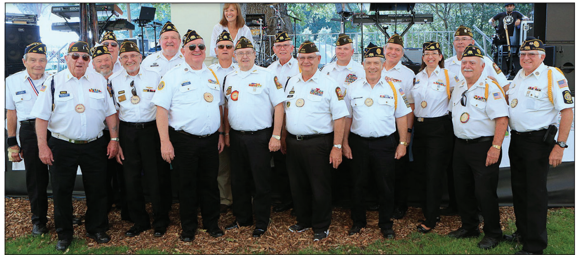
American Legion Post 237 is proud to use their military service as a way to assist others on active duty or through donations.