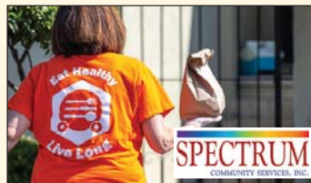
Excellence in Service SPECTRUM COMMUNITY SERVICES