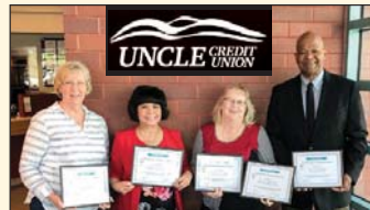
Business Philanthropy UNCLE CREDIT UNION