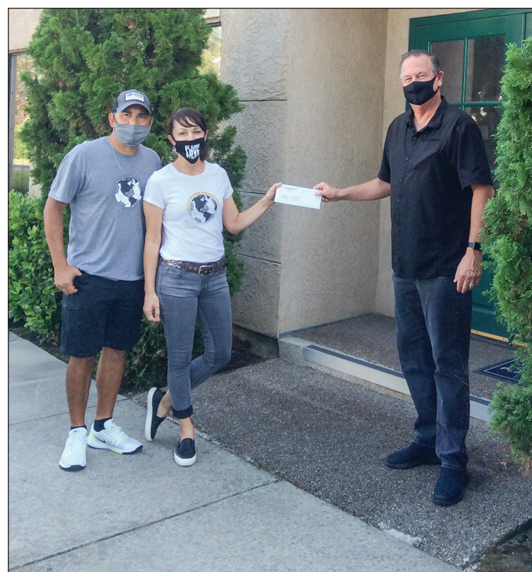
From Girls Soccer Worldwide: "Thank you to the Pleasanton Chamber for your donation! We are beyond thankful for your continued support and know your generosity will make a great impact helping young girls to believe in their voice and learn how to use it for change, the right kind of change!"

Learn more online at www.girlssoccerworldwide.org or visit Girls Soccer Worldwide on Instagram and Facebook.