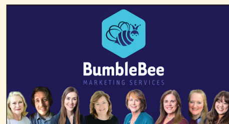
Excellence in Business BUMBLEBEE MARKETING SERVICES