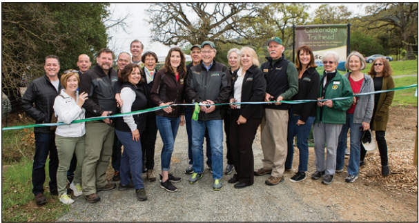
Green Business EAST BAY REGIONAL PARK DISTRICT

Spectrum Community Services serves more than just a meal to over 270 homebound Tri-Valley residents each day. As a non-profit organization that assists low-income individuals, families, and seniors in their efforts to live independently in the Tri-Valley, they not only serve Meals on Wheels, they also provide LIHEAP – Low-Income Home Energy Assistance Program - for PG&E utility bills and energy efficiency. Spectrum’s Meals-on-Wheels program delivered over 55,000 meals last year. Dedicated Meals-on-Wheels volunteers deliver a nutritious meal, a safety check and the smile that serve as a lifeline to seniors of limited mobility. Enabling seniors to stay in their own homes means they remain happier, extend their independence and can stay connected to the communities and surroundings that provide them comfort. As seniors in Alameda County are still facing food insecurity and isolation, Spectrum is serving more seniors now than ever before providing meals to both homebound and mobile seniors.