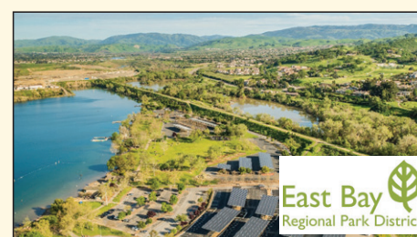
Green Business EAST BAY REGIONAL PARK DISTRICT