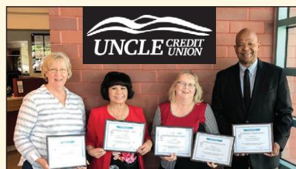
Business Philanthropy UNCLE CREDIT UNION