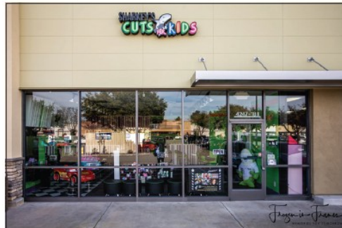
Sharkey's Cuts for Kids is located in the Rose Pavilion shopping center and offers kid-friendly haircuts for all ages as well as special events such as Glamour Girl birthday parties.