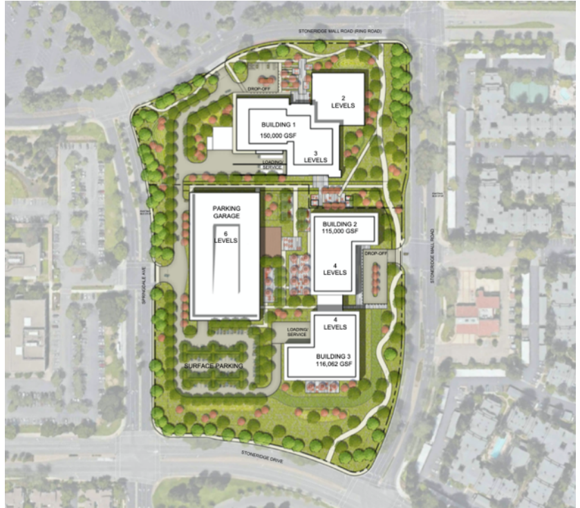
Full build out