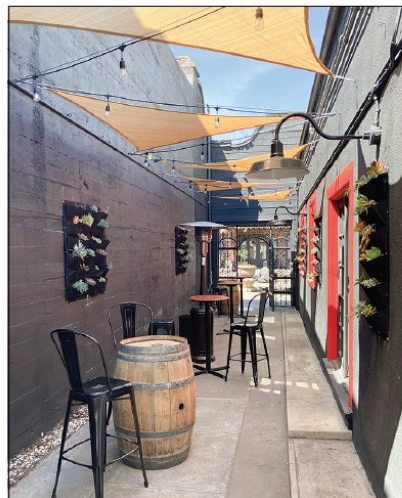
The 900 square foot outdoor patio at Gilman Brewing Company is a signature of the Pleasanton location with its high trestles full of string lights destined for unforgettable beer and culinary experiences.

Gilman Brewing has been recognized for its premium IPAs, double IPAs, hazy IPAs, tart sours, fruit-forward beers, and a distinguished ros-