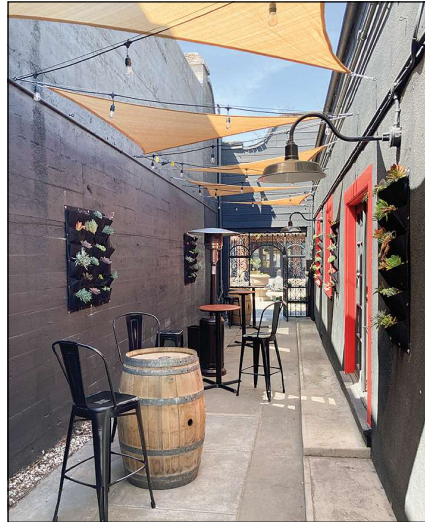
The 900 square feet outdoor patio at Gilman Brewing Company is a signature of the Pleasanton location with its high trestles full of string lights destined for unforgettable beer and culinary experiences.

Gilman Brewing has been recognized for its premium IPAs, double IPAs, hazy IPAs, tart sours, fruit-forward beers, and a distinguished ros-