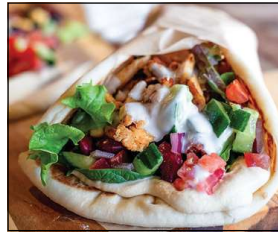
Yafa Hummus serves authentic flavors in bowls and wraps, with three proteins to choose from.

Plans don't always work out how you envision and sure enough, the