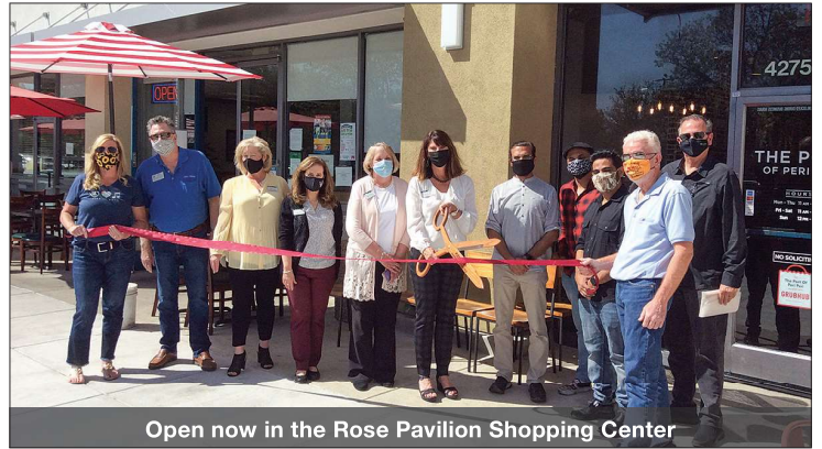
Open now in the Rose Pavilion Shopping Center