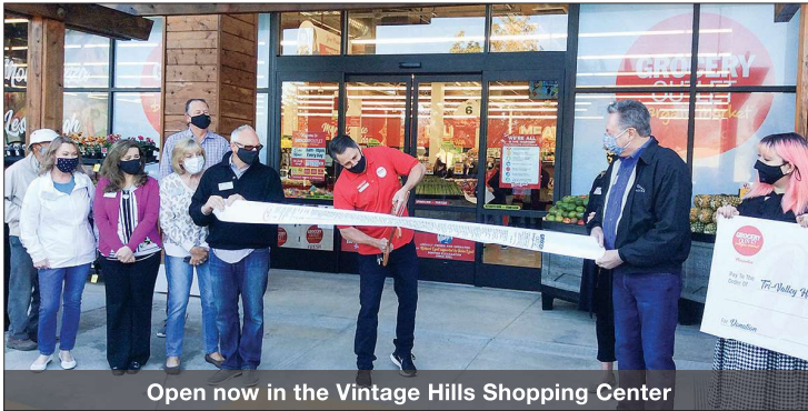
Open now in the Vintage Hills Shopping Center