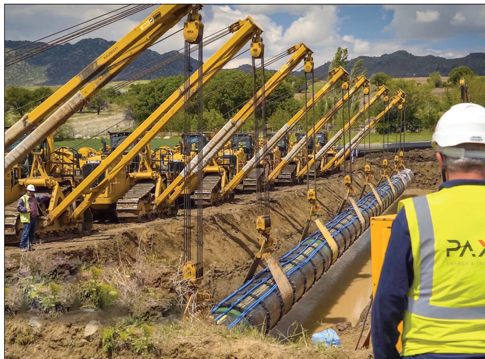
Paxon is a leader in addressing the extensive upgrades required for our nation's electric grid, and local gas systems.