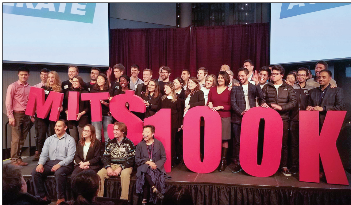
Enigmata is developing vaccines and immunostimulatory lipid nanoparticles (adjuvants) that make effective vaccines that can be distributed at room temperature. Enigmata was a finalist at the MIT $100K Accelerate competition in 2020.

Paxon also provides value-added quality management assurance and safety services to clients across the country. Paxon's team of experienced staff understands how to vby addressing all assets throughout their entire lifecycle from conceptualization through construction, operations, maintenance, and replacement.