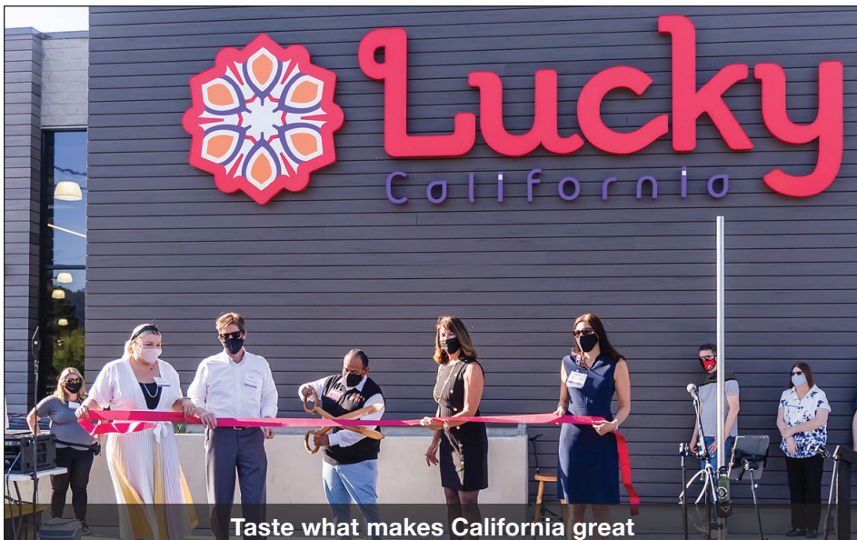
Taste what makes California great