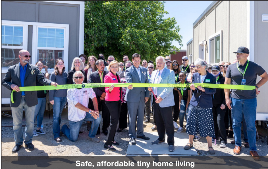
Safe, affordable tiny home living

Goodness Village – Goodness Village is a sustainable tiny home community that provides affordable and permanent housing options in a supportive community for people experiencing chronic homelessness. The Goodness Village concept encompasses not just housing, but also community building and meaningful employment. The Village consists of 28 single-occupancy permanent tiny homes available on site at the CrossWinds Church grounds on the historic Livermore Dairy at 1660 Freisman Road in Livermore.