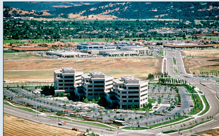
During the 1980s, Pleasanton experienced tremendous growth, not only in Hacienda, but with chamber membership as well.