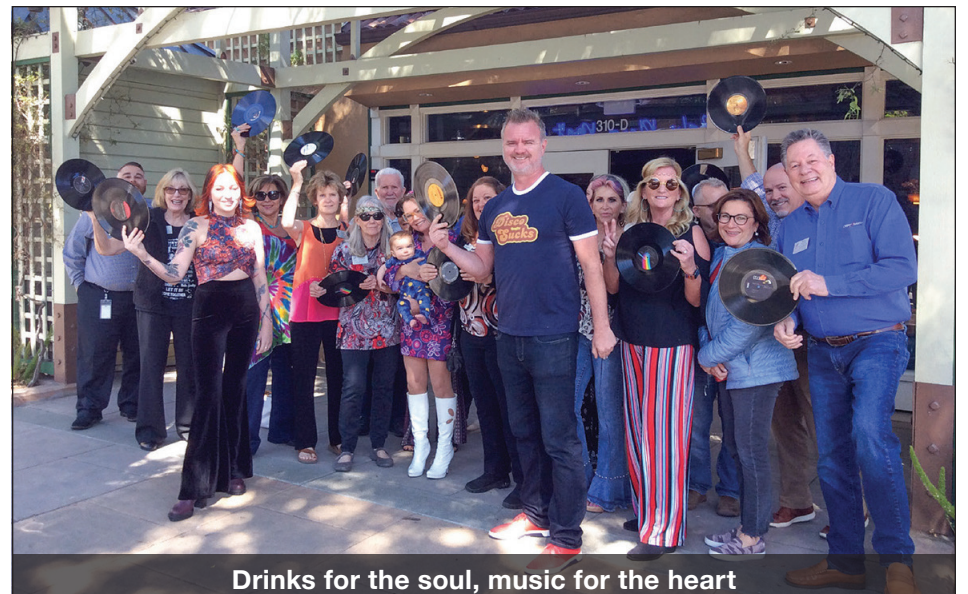
Drinks for the soul, music for the heart

Middle 8 – Middle 8 bar is the updated version of your favorite 70's bar. With a huge space and a private party room, it is the place to go when you're ready for a craft cocktail, a cold beer, or a great glass of wine. Named after the eight measures in the middle of a song, the place that the tempo changes and the promise of something different, Middle 8 is Pleasanton newest bar open seven nights a week from 4:00 p.m. until 1:00 a.m. at 310 Main Street, Suite D in Pleasanton. Follow Middle 8 on Facebook and Instagram.