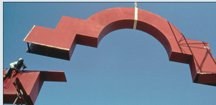
In 1982, an ordinance was passed approving the first phase of Hacienda.