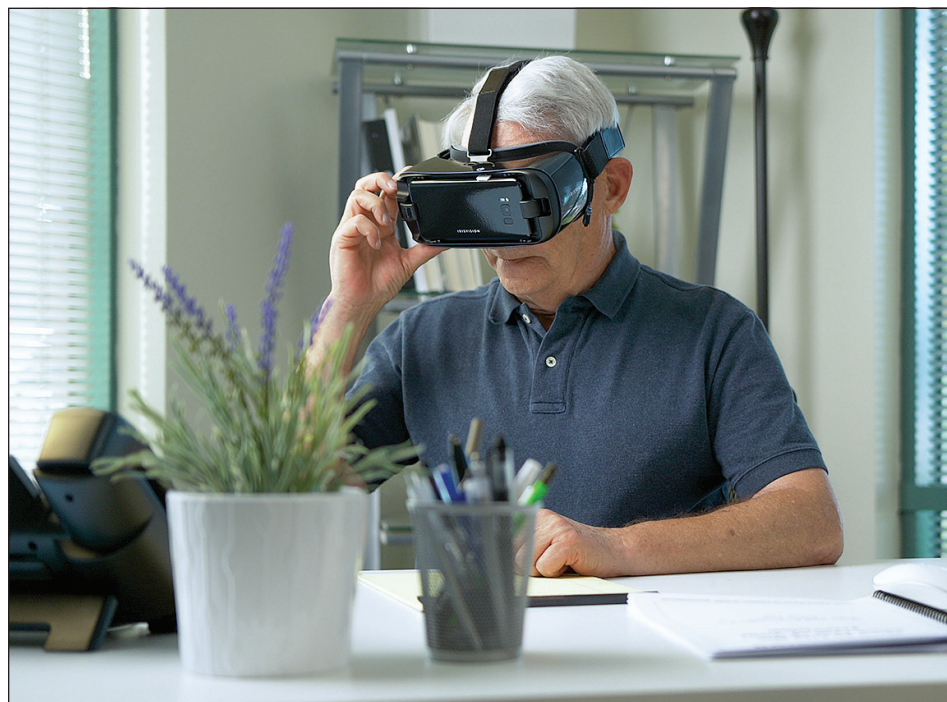
IrisVision's clinically validated digital vision and telehealth solutions help even the most challenging and at-risk patients preserve and make the most of their sight.