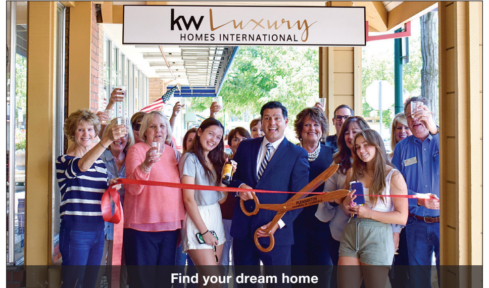
Find your dream home