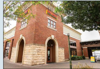
There are three Chaat Bhavan restaurants in the Bay Area, including this one on Grafton Street in Dublin.