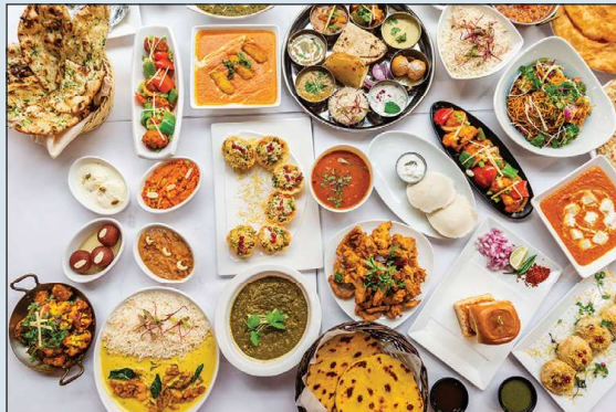
The food served at Chaat Bhavan includes Punjabi food and each dish has a unique flavor, taste, texture, and is cooked to perfection.

"Customers at Chaat Bhavan are more than just diners. When they