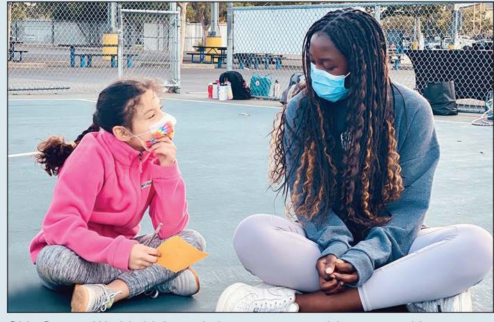
Girls Soccer Worldwide's workshops are created for young girls, focusing on confidence, courage, and character.

Learn more at annettefreidesign.com, by emailing annette@annettefrei.com or calling 480-707-2903.