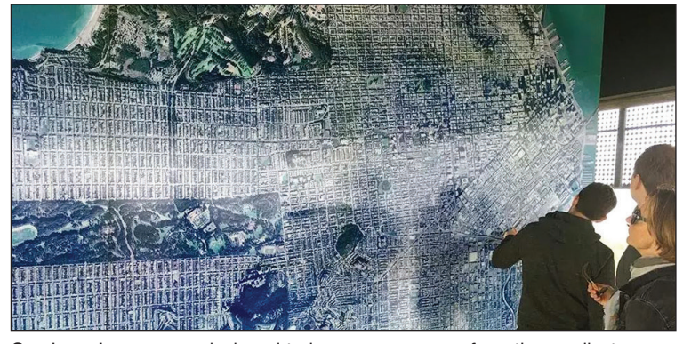
GeoJango's maps are designed to impress everyone, from the smallest maps to the giant wall maps

Explorer Cards is a new Geography Trivia Game for learning more about the world. Discover, learn, and challenge your friends and family with information about significant sites around the world. The Explorer Card deck includes 50 cards, featuring 50 destinations around the world and game instructions.