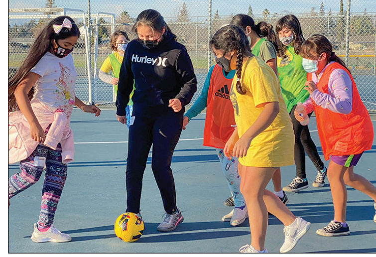
Girls Soccer Worldwide brings the sport to girls where they are at, creating opportunities, on and off the field, to play and gain leadership skills needed to succeed in life

Their secret sauce? Girls Soccer Worldwide<sup>™</sup> was created around the idea of girls empowering girls. Each Grassroots workshop is codeveloped and co-facilitated by their Ambassador for Change Leaders who are high school age girls