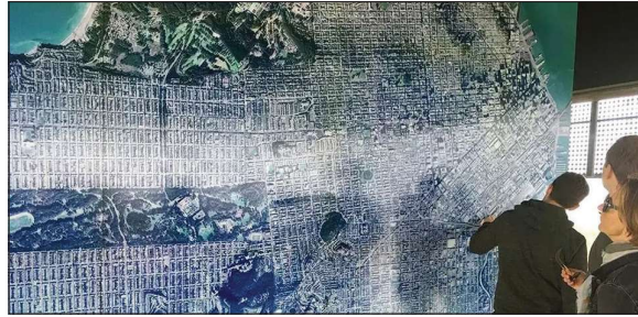
GeoJango's maps are designed to impress everyone, from the smallest maps to the giant wall maps.

Explorer Cards is a new Geography Trivia Game for learning more about the world. Discover, learn, and challenge your friends and family with information about significant sites around the world. The Explorer Card deck includes 50 cards, featuring 50 destinations around the world and game instructions.