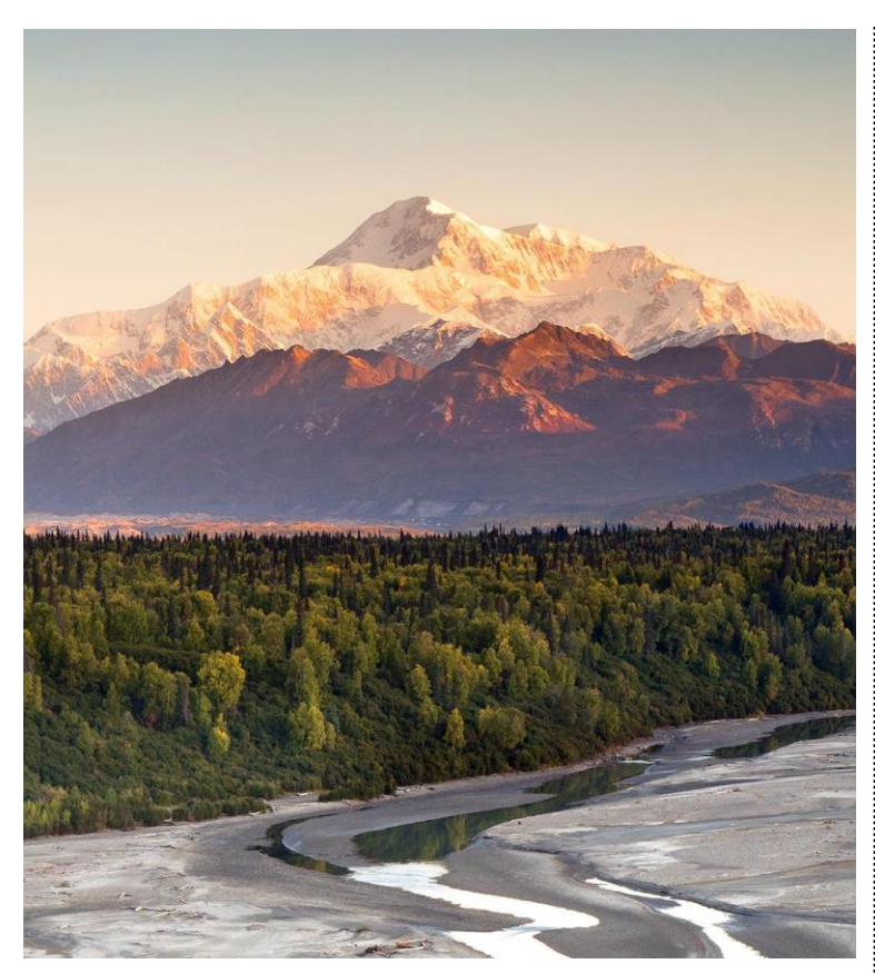
9 Days • 13 Meals: 8 Breakfasts, 2 Lunches, 3 Dinners

HIGHLIGHTS... Fairbanks, Gold Mining, Trans-Alaska Pipeline, Dog Mushing, Denali National Park, Tundra Wilderness Tour, Talkeetna, Musk Ox Farm, Anchorage, Prince William Sound Glacier Cruise