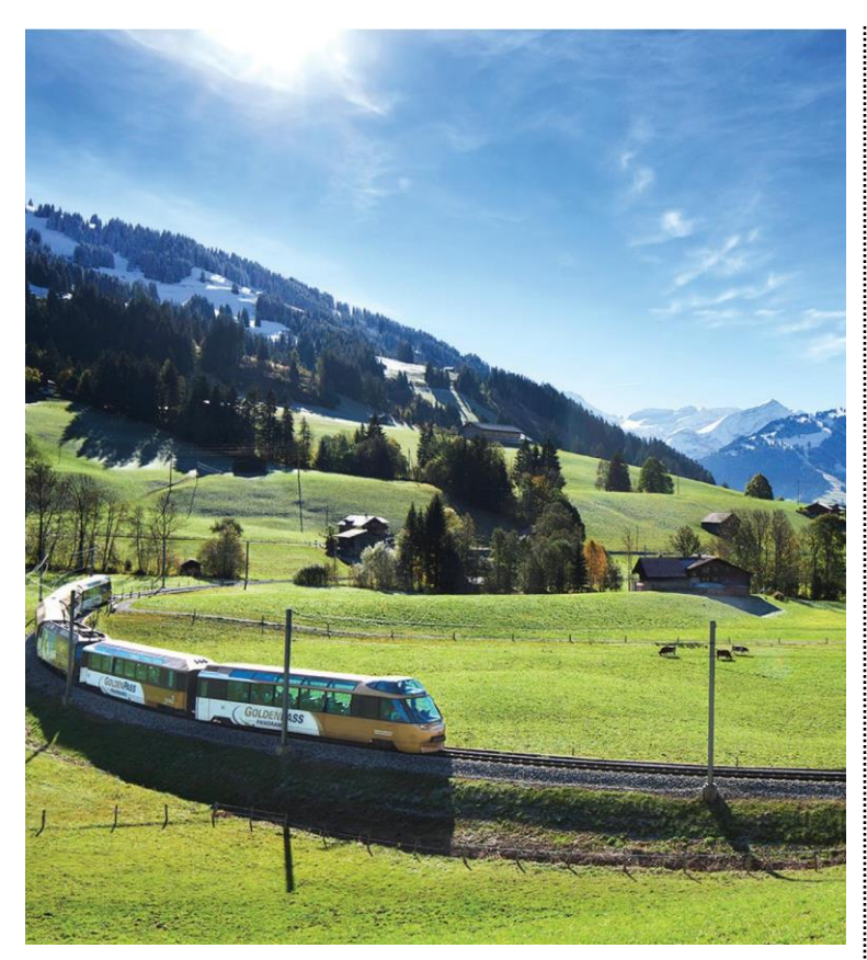
10 Days • 12 Meals: 8 Breakfasts, 1 Lunch, 3 Dinners

HIGHLIGHTS... Lucerne, Mount Pilatus, Bern, Austrian Alps, Choice on Tour, Innsbruck, Salzburg, Mirabell Gardens, St. Peter's Restaurant, Bavaria, Linderhof Palace, Tyrolean Folklore Show, Munich Oktoberfest