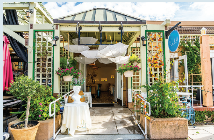
Open seven days a week in the heart of downtown Pleasanton on Main Street, Elia brings your taste of authentic Greek food to reality.

With one of the largest patios in the area, Elia features 60+ outdoor seats with a gorgeous fireplace overlooking Main Street. Elia is located at 310-A Main Street in downtown Pleasanton. Learn more at eliapleasanton.com .