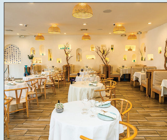
Enjoy the fine dining experience and ambiance at Elia.