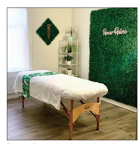
Renew + Restore Healthcare is located at 855 Main Street Suite #201 in downtown

Traditionally, manual lymphatic drainage therapy (MLD) was reserved for those with a compro-