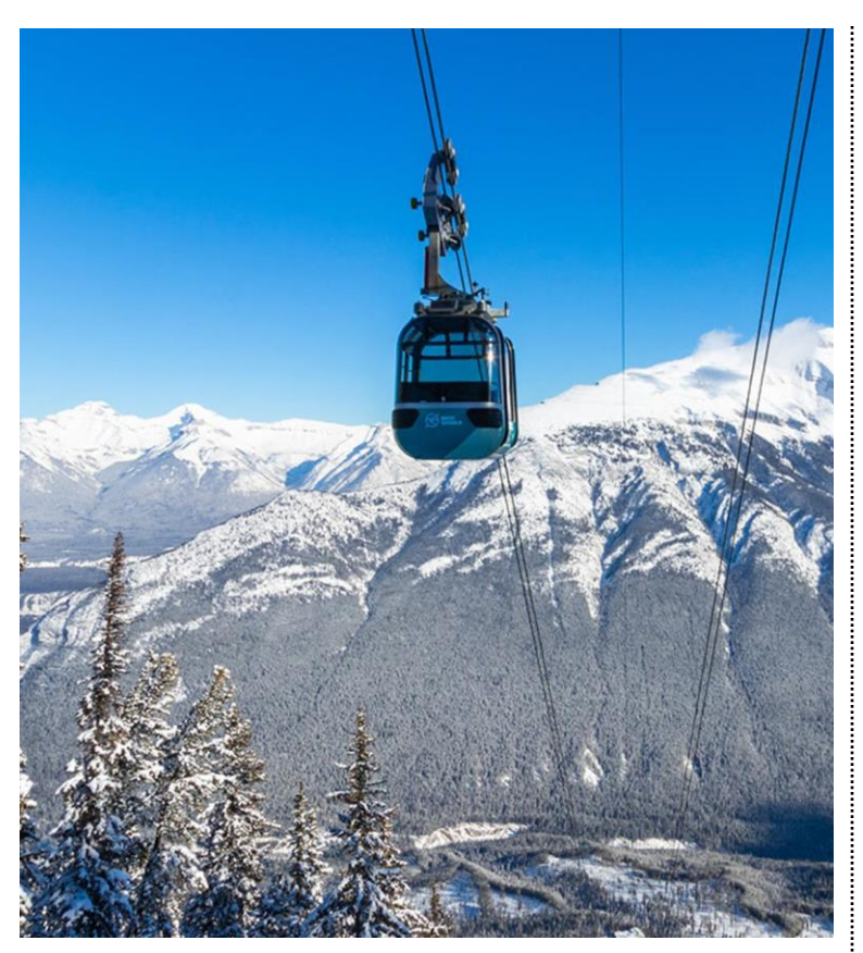
9 Days • 13 Meals: 8 Breakfasts, 2 Lunches, 3 Dinners

HIGHLIGHTS... Calgary, Albertan BBQ, Banff, Bow Falls, Lake Louise, Revelstoke Railway Museum, Okanagan Valley, Vineyard Dinner and Wine Tasting, Vancouver, Stanley Park, Granville Island