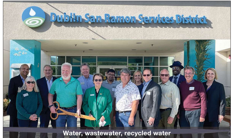
Water, wastewater, recycled water

Chabot Las Positas Community College District – The Chabot Las Positas Community College District was pleased to celebrate the opening of their new offices, located at 5860 Owens Drive on the third floor in Pleasanton. Their Economic Development and Contract Education department (EDCE) works "at the speed of business" with both public and private sector organizations to provide a broad range of educational, training, consulting and fiscal-related support services. We empower individuals and communities to thrive by creating career, education and economic opportunities. Learn more at www.clpccd.org .