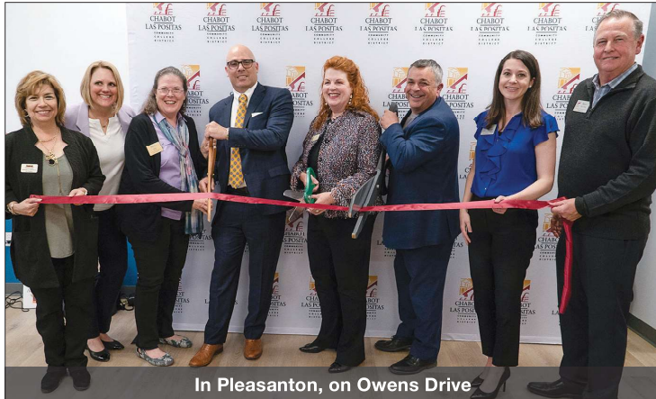
In Pleasanton, on Owens Drive

Hively Family Resource Center – The Hively Family Resource Center (HFRC) provides a one-stop shop for families to obtain all the basic necessities they need. The Diaper Pantry provides diapers, wipes and early literacy materials; the Community Closet provides new and gently used clothing, shoes, books and housewares; and the Food Pantry provides food and other basic necessities. All the resources are provided free of charge to families in need. The new HFRC promotes Hively's mission to provide resources and support so that everyone in our community can thrive. Visit Hively at www.behively.org .