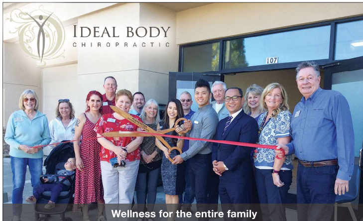
Wellness for the entire family

Ideal Body Chiropractic – Ideal Body Chiropractic has provided exceptional chiropractic care for over 10 years and is now proud to serve the communities of Pleasanton and surrounding areas including, but not limited to Livermore, Dublin, San Ramon, Danville, Castro Valley, and Fremont. Their focus is to help your body heal naturally and provide immediate pain relief, stability, and improved overall health and wellness. Ideal Body Chiropractic is located at 3283 Bernal Avenue, Suite 107 in Pleasanton. Call for an appointment (925) 232-1058 or check them out at idealbodypleasanton.com .