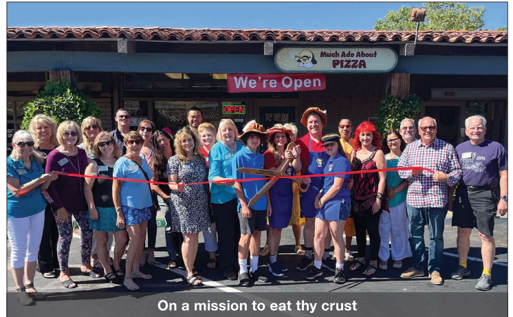
On a mission to eat thy crust

Heart of the Home Cabinetry — Heart of the Home Cabinetry is a locally owned kitchen and bathroom cabinetry and design company. They offer high quality semi-custom and custom cabinetry for kitchen and bathrooms, along with the design know how to create your perfect space. They just celebrated the grand opening of their new showroom. Modern design meets cozy comfort. They will create your perfect space. Visit Heart of the Home Cabinetry at 4337 First Street, Suite C in Pleasanton or online at www.hothcabinetry.com .