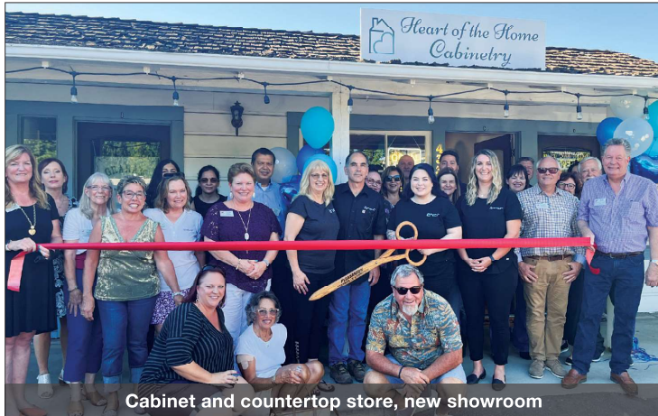
Cabinet and countertop store, new showroom

Heart of the Home Cabinetry — Heart of the Home Cabinetry is a locally owned kitchen and bathroom cabinetry and design company. They offer high quality semi-custom and custom cabinetry for kitchen and bathrooms, along with the design know how to create your perfect space. They just celebrated the grand opening of their new showroom. Modern design meets cozy comfort. They will create your perfect space. Visit Heart of the Home Cabinetry at 4337 First Street, Suite C in Pleasanton or online at www.hothcabinetry.com .