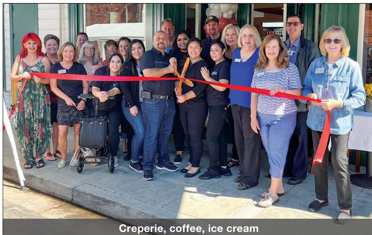
Creperie, coffee, ice cream