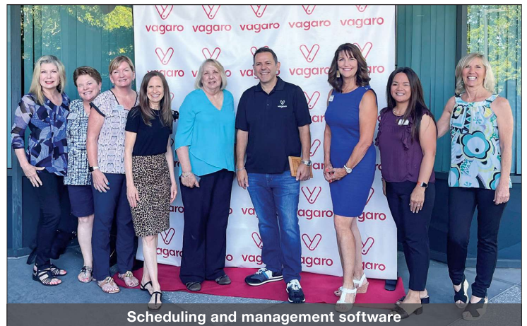
Scheduling and management software