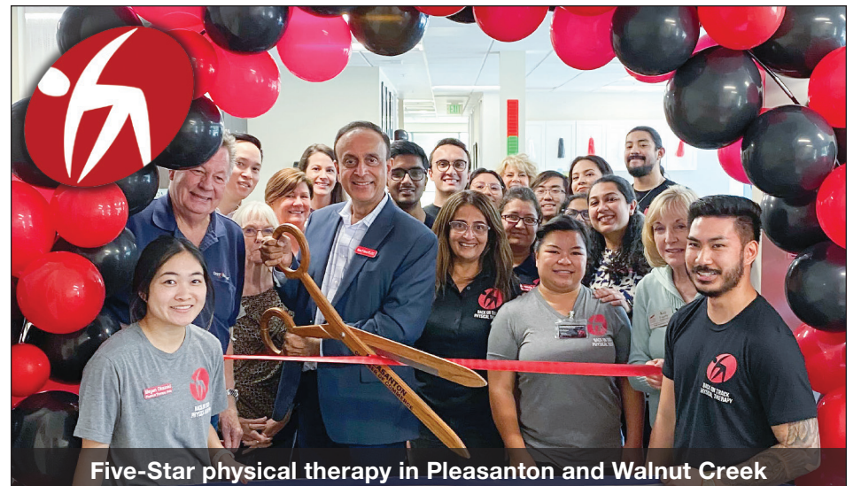
Five-Star physical therapy in Pleasanton and Walnut Creek

Mochiholic — Mochiholic celebrated its one-year anniversary in business. This premium Japanese-style mochi donut shop serves delicious mochi donuts and boba daily in the Rose Pavilion shopping center. Mochiholic is located in Rose Pavilion Plaza in Pleasanton, next to Total Wine. Open for takeout, online order ahead pick-up, and delivery Monday through Friday, 10:00 a.m. to 8:00 p.m. Email mochiholicca@gmail.com for catering and event inquiries. www.mochiholic.com