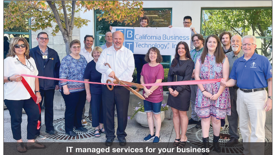
IT managed services for your business

Ambiance Design & Staging — Ambiance Design & Staging offers innovative residential and commercial design consultations, complete home remodeling services and home staging with a wealth of knowledge to assist in profitable real estate sales. Got an idea of what you want, but not sure how to get that done? That's where Ambiance Design & Staging comes in. They mix your dream with their creativity, experience and resources to get the beautiful and functional home you've always wanted. New warehouse now open at 1069 Serpentine Lane, Suite 500, in Pleasanton. Learn more at ambiancestaging.com .