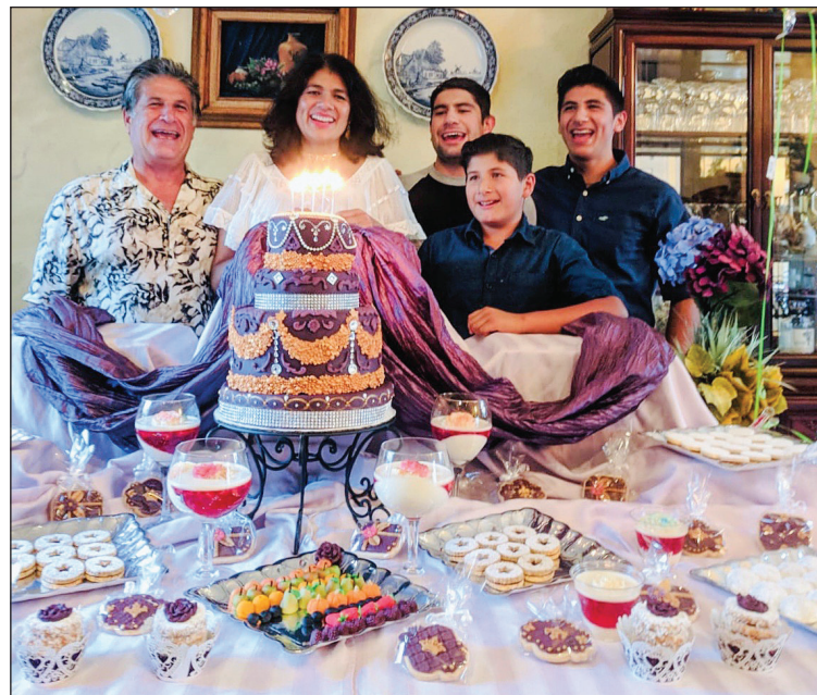
Passion Pastry makes delicious premium pastries inspired by recipes from around the world.