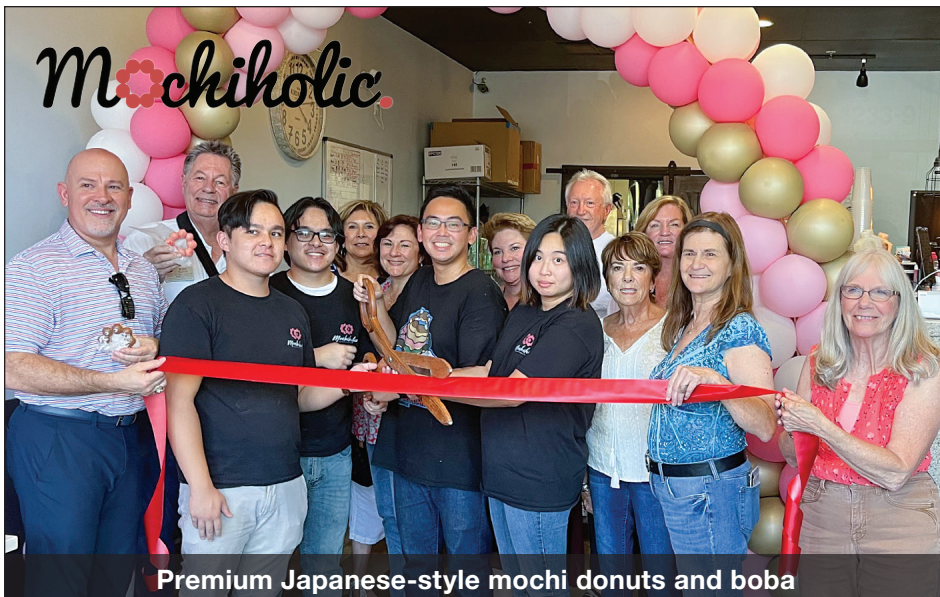
Premium Japanese-style mochi donuts and boba

California Business Technology — California Business Technology® (CBT), Inc. is a managed information technology service provider. CBT provides on-site and remote support for organizations, leveraging industry-leading remote monitoring and management (RMM) tools. CBT is committed to supporting your information technology needs allowing organizations to focus on their own business. The CBT team has built partnerships with major technology vendors, including but not limited to Microsoft, Google, and Comcast, and can design a technology solution that best fits a company's specific needs. For further information, call us at (925) 426-2322 or learn more at cbt.io . Its new office location is on Owens Drive in Pleasanton.