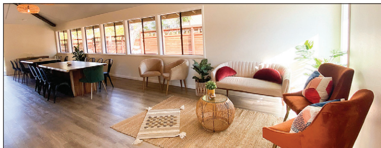
Good Morning Maxwell Pleasanton's Bungalow Place is a beautiful, bright event space near Downtown Pleasanton, featuring 1,200 square feet of modern and flexible space.

Learn more about Good Morning Maxwell by visiting www.goodmorningmaxwell.com , emailing events@goodmorningmaxwell.com or by calling 925-738-8003.