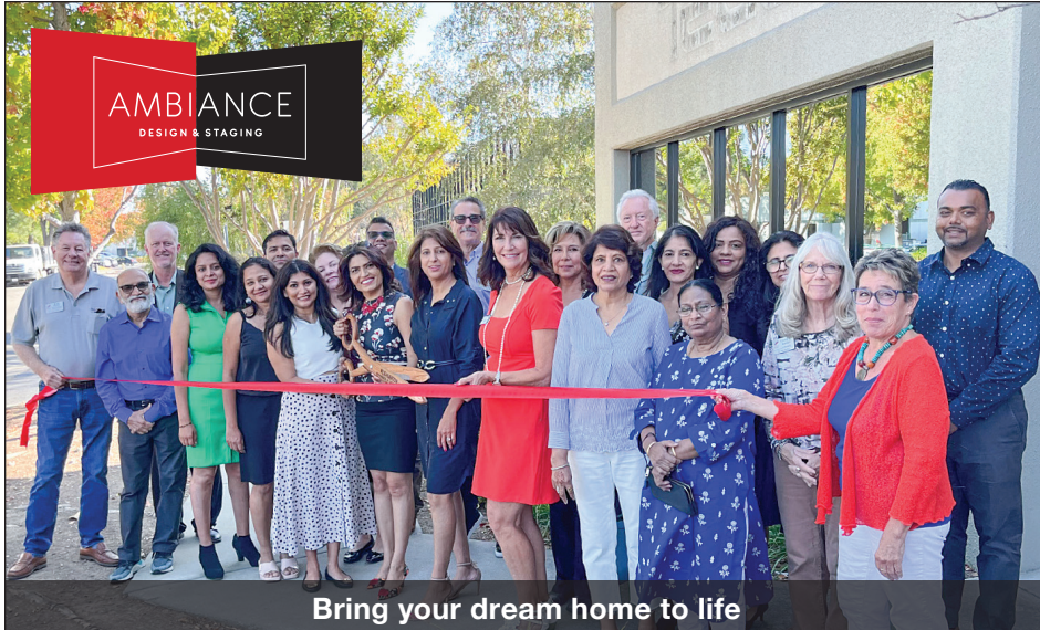
Bring your dream home to life

Ambiance Design & Staging — Ambiance Design & Staging offers innovative residential and commercial design consultations, complete home remodeling services and home staging with a wealth of knowledge to assist in profitable real estate sales. Got an idea of what you want, but not sure how to get that done? That's where Ambiance Design & Staging comes in. They mix your dream with their creativity, experience and resources to get the beautiful and functional home you've always wanted. New warehouse now open at 1069 Serpentine Lane, Suite 500, in Pleasanton. Learn more at ambiancestaging.com .