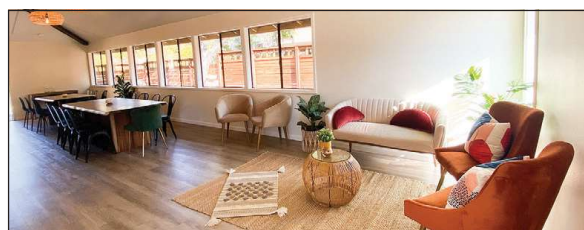
Good Morning Maxwell Pleasanton's Bungalow Place is a beautiful, bright event space near Downtown Pleasanton, featuring 1,200 square feet of modern and flexible space.