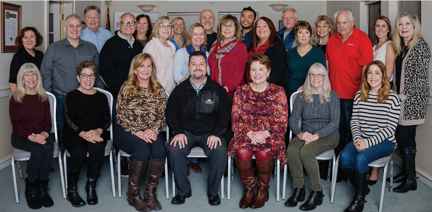
The Pleasanton Chamber's Ambassador committee, pictured at the January monthly meeting, serves as the public relations arm of the Chamber. Ambassadors promote the Chamber to prospective members and the community as a whole.

Pleasanton Chamber of Commerce: Advancing the economic vitality of our community since 1946