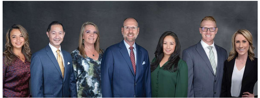
At the Bay Area Synergos Group, our investment process focuses on the long term while simultaneously preparing you for unforeseeable bumps along the way.

We work closely with your attorney and accountant to develop a plan in concert, not at odds with each other. If you wish, we can introduce you to professionals with the experience to help you meet the specific challenges you face.