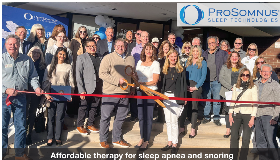
Affordable therapy for sleep apnea and snoring