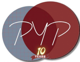
Pleasanton Young Professionals

For me, 2023 is about building community, bringing innovation, and gaining more awareness to the group and the Pleasanton Chamber as a whole. With the continued support of the Chamber, and our very talented executive committee team, I have the utmost confidence that we can achieve our goals this year. If you, or someone you know, are a Pleasanton Chamber member, you can enjoy all of the benefits and success of the group as well.