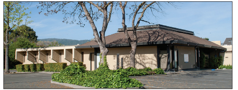
For the past two years, Valley Humane Society has been working to bring an important lifesaving solution to our community: the Phil Scholz Veterinary Surgery Center, which is located at 120 Spring Street in Pleasanton.