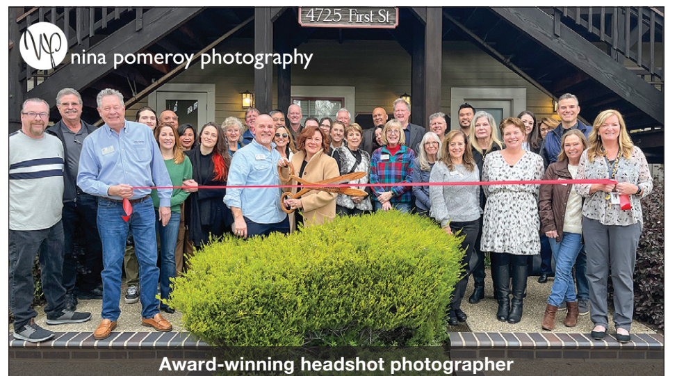
Award-winning headshot photographer

Interpretive Pavilion at Shadow Cliffs — The East Bay Regional Park District celebrated the completion of the outdoor interpretive pavilion at Shadow Cliffs in Pleasanton. The newly installed 1,000-square-foot outdoor exhibit provides a staging area and gateway to the park's 116-acre nature area that incorporates trails for walking, hiking, biking, and nature watching. With a shaded and weather-protected gathering spot for all visitors – including children participating in year-round school field trips and programs led by the Park District's interpretive staff – the pavilion features a series of educational exhibits about the natural and cultural history of Shadow Cliffs' native plants, wildlife, and environmental sustainability. Located at the Shadow Cliffs Regional Recreation area at 2500 Stanley Blvd. in Pleasanton. Learn more online at www.ebparks.org .