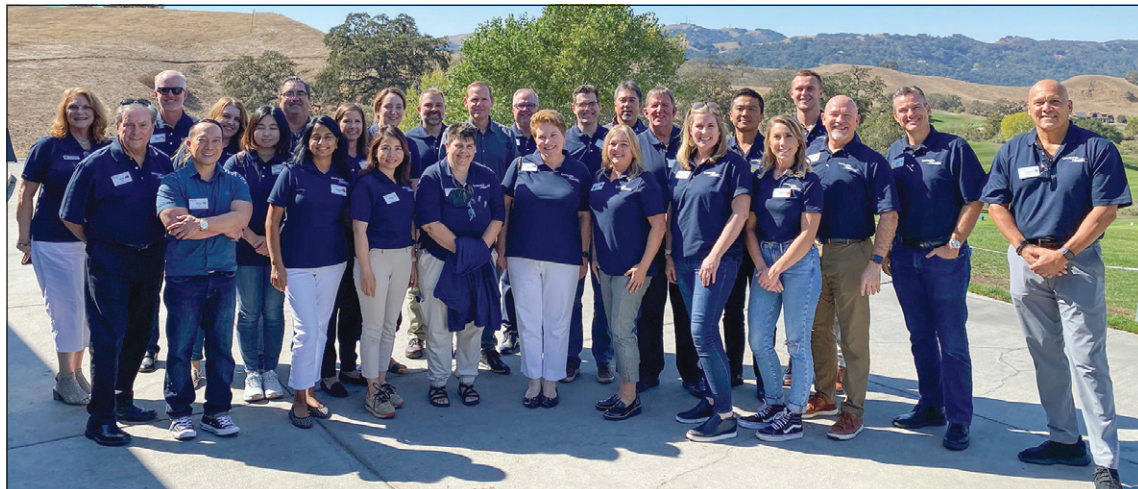
The Leadership Pleasanton class of 2023 pictured at Callippe Preserve Golf Course during Local Government day in October of 2022.