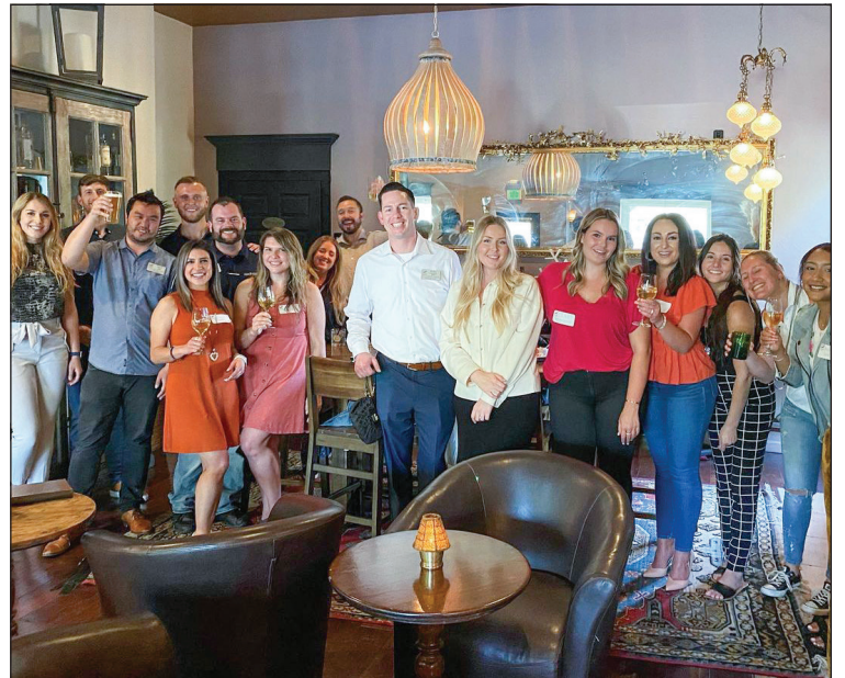
The PYPs have developed a legacy of learning, growth, and empowerment to our future leaders and our community. This year, they are celebrating their 10-year anniversary.