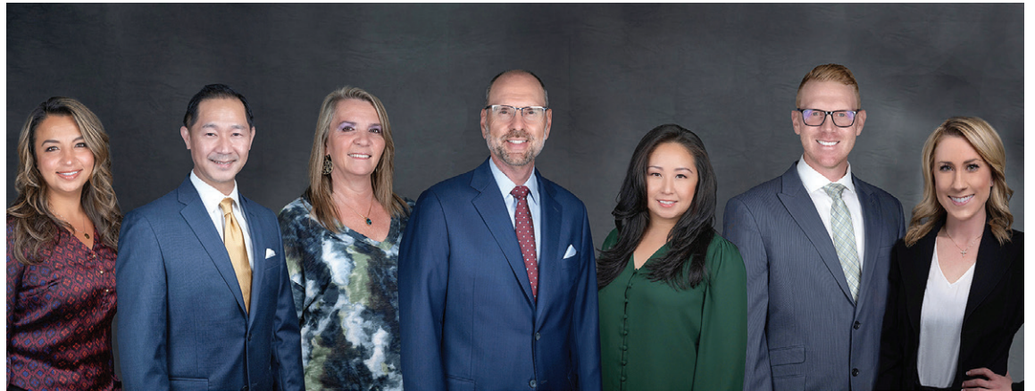
At the Bay Area Synergos Group, our investment process focuses on the long term while simultaneously preparing you for unforeseeable bumps along the way.

We work closely with your attorney and accountant to develop a plan in concert, not at odds with each other. If you wish, we can introduce you to professionals with the experience to help you meet the specific challenges you face.