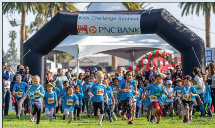
The Pleasanton Run for Education is PPIE's largest fundraiser of the year, and serves to celebrate our community, encourage fitness, and support our schools.