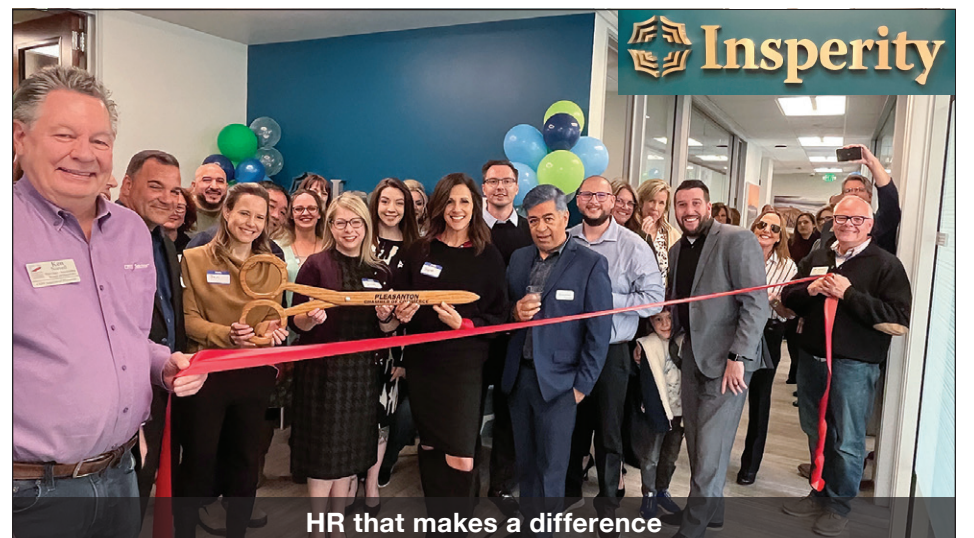
HR that makes a difference

ProSomnus Sleep Technologies — ProSomnus is the leading manufacturer of precision, patient preferred, Oral Appliance Therapy medical devices for the treatment of Obstructive Sleep Apnea (OSA). ProSomnus Therapy helps you get a restful night of sleep without noisy machines, masks, or hoses. Learn why hundreds of thousands of patients are ditching their CPAP and sleeping with ProSomnus. Wearing the ProSomnus device (like a mouthguard for your upper and lower jaw) holds your lower jaw gently forward and opens the airway in the back of your throat. ProSomnus Sleep Technologies celebrated the grand opening of its new global headquarters on Gibraltar Drive in Pleasanton. Learn more at prosomnus.com .