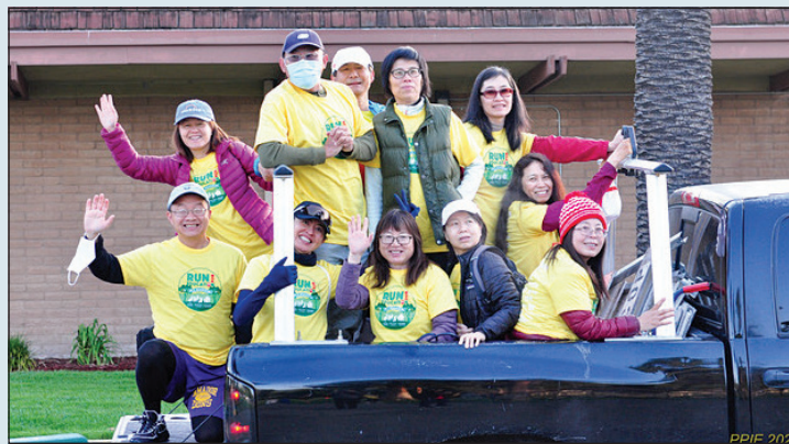
Pleasanton Partnerships in Education Foundation (PPIE) is a nonprofit organization that exists to enhance learning experiences for students of the Pleasanton Unified School District through a partnership of business, education and the community.

PPIE recently hosted the 4th annual State of the School District. Superintendent Dr.