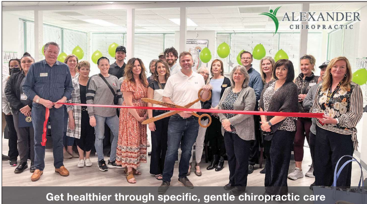
Get healthier through specific, gentle chiropractic care

Rubys & Roses — Rubys & Roses is a new dining experience located in the heart of downtown Pleasanton that offers an elegant atmosphere, specializing in American cuisine and cocktails. The restaurant is perfect for those looking to indulge in a luxurious dining experience. From the delicious starters to the mouth-watering entrees and decadent desserts, Rubys and Roses offers a culinary experience that is sure to impress. The restaurant's signature cocktails are expertly crafted and perfectly complement the menu, making Rubys and Roses the perfect destination for a special night out. Learn more at rubysandrosesrestaurant.com . Located at 855 Main Street in Pleasanton.