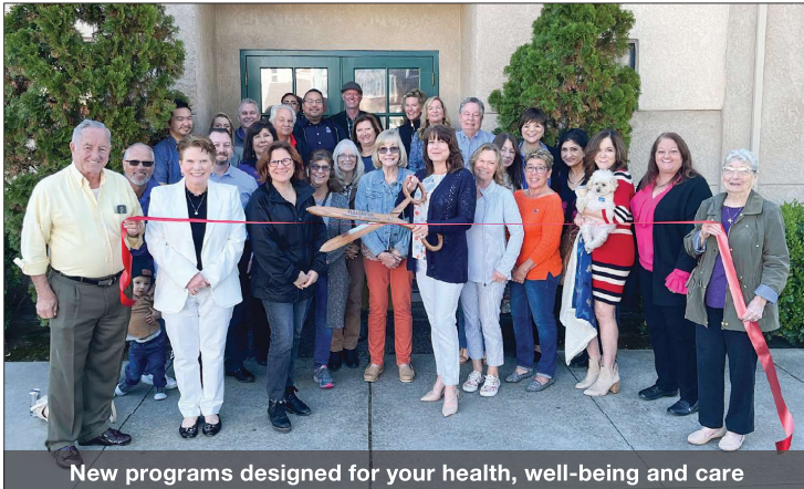
New programs designed for your health, well-being and care