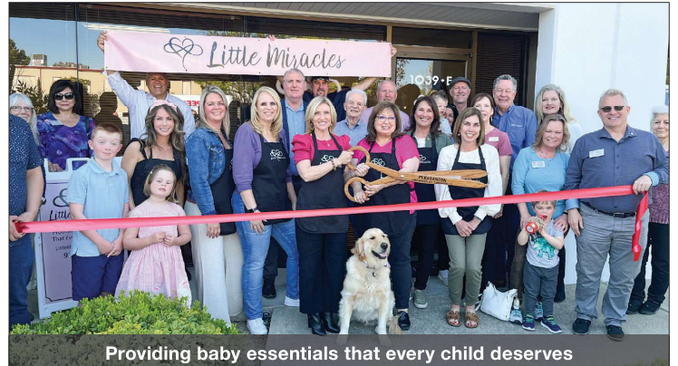
Providing baby essentials that every child deserves

Alexander Chiropractic and Wellness — Is pain or decreased function leaving you feeling sidelined in life? Perhaps you've been searching for a chiropractor in town. However, you don't want to waste your time, money, and health going to someone who doesn't have your best interest at heart. We get it. At Alexander Chiropractic and Wellness, we have an excellent reputation for providing care that gets results. Our doctors are passionate about helping their community live happier and healthier lives. Friendly and caring, our doctors will provide the healing help you need. We welcome new patients, both young and old, with open arms. Our approach to chiropractic care is gentle and specific. Learn more at alexanderchiro.com . Located at 7031 Koll Center Parkway, Suite 160 in Pleasanton.