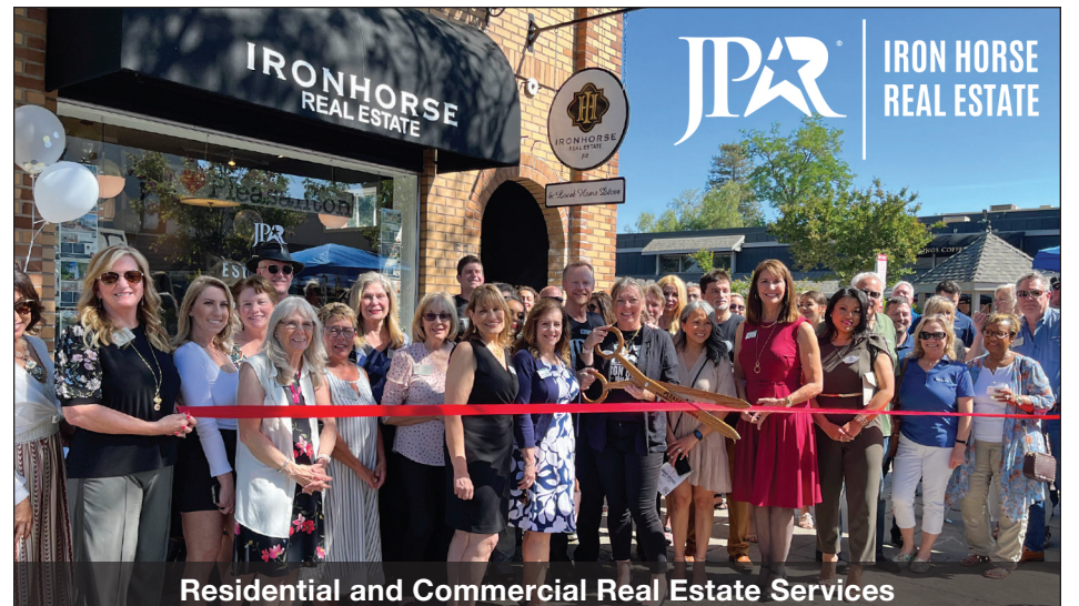
Residential and Commercial Real Estate Services

Phil Scholz Veterinary Surgery Center — The Phil Scholz Veterinary Surgery Center provides much-needed spay and neuter services to the public as well as shelter and rescue partners, many of whom experience significant delays in locating available spay/neuter appointments for their adoptable animals. With the ability to perform up to 140 surgeries a week, the surgery center will significantly reduce local pet overpopulation, enable rescue groups to ready their homeless pets for adoption faster, and move animals from shelters, including Valley Humane Society, into homes more quickly. They are currently booking appointments for low-cost spay/neuter. Learn more at www.valleyhumane.org/programs/surgery-center/ .