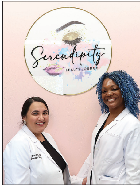
Serendipity Beauty Lounge is located at 4450 Black Avenue, Suite A in Pleasanton.

working in the hospital setting for so many years, Tamara decided to mix things up a bit and branch out into the happy medicine that is aesthetics. She is committed to providing her patients with the best possible outcomes using the safest techniques.