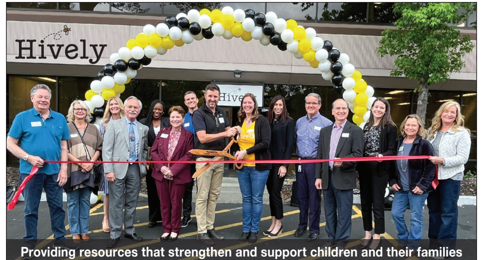
Providing resources that strengthen and support children and their families