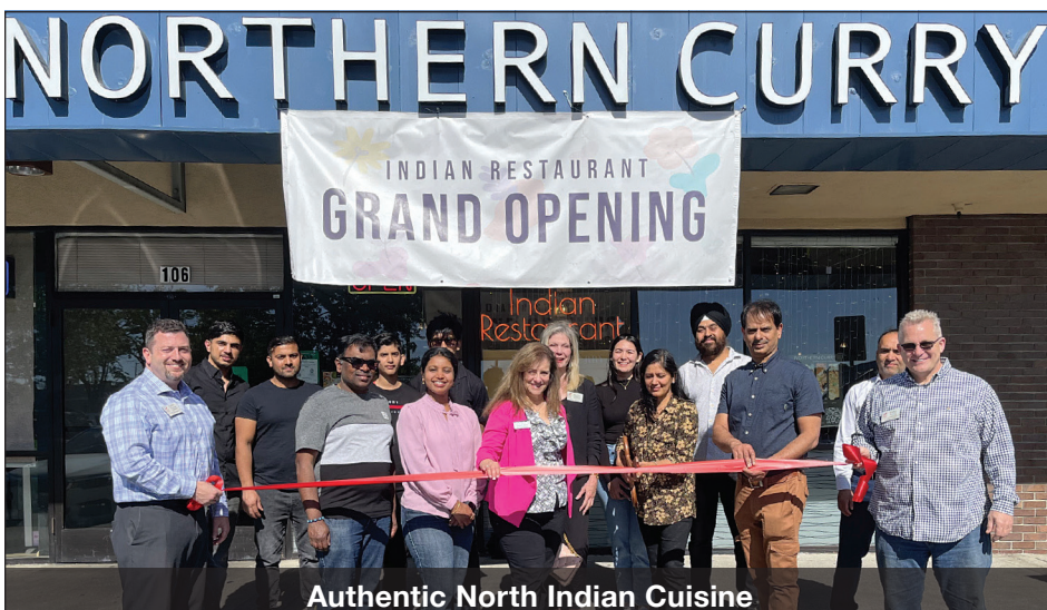
Authentic North Indian Cuisine

JPAR Iron Horse Real Estate — JPAR Iron Horse Real Estate is a people company doing real estate with great technology. Located in downtown Pleasanton, JPAR Iron Horse Real Estate is focused on the relationships, referrals, and connections at the heart of every real estate transaction. For our clients, we train our agents to provide the best available service and make buying or selling a home as seamless as possible. For our agents, we provide an environment that allows you to do what you do best – serve your clients' needs. Through JPAR®, we offer the best-in-class tools and technology with a single comprehensive sign-on platform which makes it easy for our agents to help their clients take the next step in homeownership. Learn more at www.jparironhorse.com