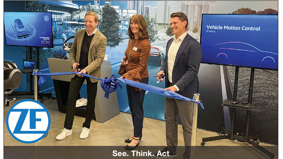
See. Think. Act

Serendipity Labs Dublin - Pleasanton — Serendipity Labs is a flexible office space company that develops and operates its upscale coworking brand as an outsourced workplace service in the U.S. and U.K. Its hub and spoke network of locations offers highly hosted workplaces that cater to the needs of the knowledge workforce with private offices, coworking, meeting and event facilities, and all-access Worktopia™ memberships. Companies of all sizes use Serendipity Labs for outsourced workplace solutions. Serendipity Labs Dublin - Pleasanton is a newly renovated building, conveniently located at the intersection of I-580 and I-680 in Dublin. Learn more at serendipitylabs.com .