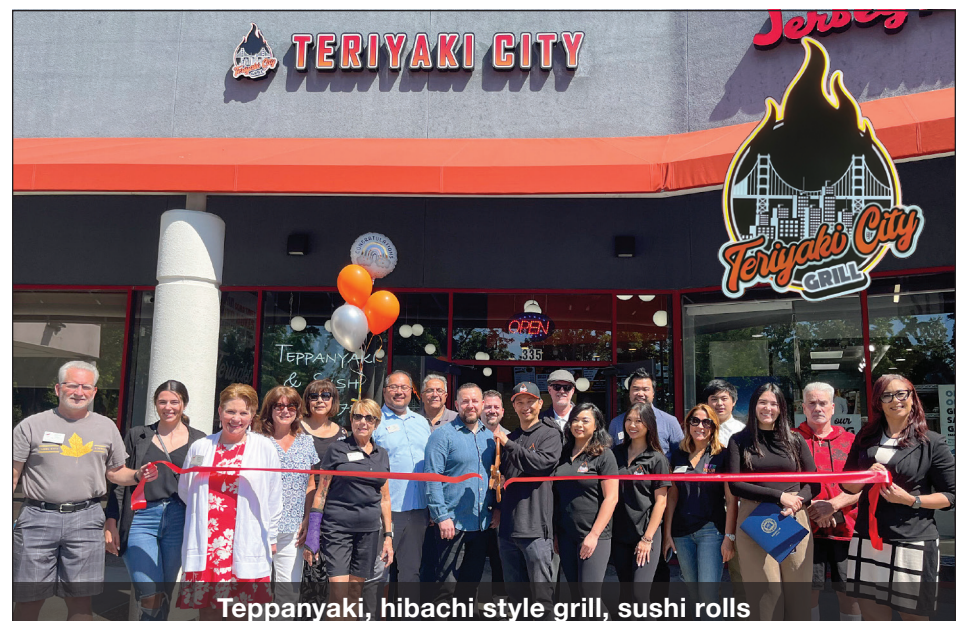
Teppanyaki, hibachi style grill, sushi rolls

Tri Valley REACH — Tri-Valley REACH builds inclusive communities for adults with intellectual and developmental disabilities to live independently by providing resources, education, activities, community, and housing opportunities. REACH envisions a community that supports their efforts to help adults with intellectual disabilities to live, access and participate fully in all aspects of an activity or service in the same way as any other member of the community. REACH relies completely on the partnership of individuals, corporations, foundations, civic organizations and city governments to support their work within the neurodiverse community. Learn more at trivalleyreach.org .