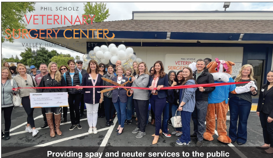
Providing spay and neuter services to the public

ZF Group — ZF is illustrating how the Software-defined vehicle (SdV) can transform mobility with new functions through advanced software and hardware connected systems at the opening of its new West Coast Mobility Hub in Pleasanton, California. At the heart of its SdV demonstration is ZF Group's High Performance ProConnect computing platform, which provides a continuous data loop in connected vehicles that allows for cloud-based computing and over-the-air (OTA) updates through the networking of GPS and Cloud-based features. ZF is a global technology company supplying systems for passenger cars, commercial vehicles and industrial technology, enabling the next generation of mobility. ZF allows vehicles to see, think and act. Learn more at www.zf.com .