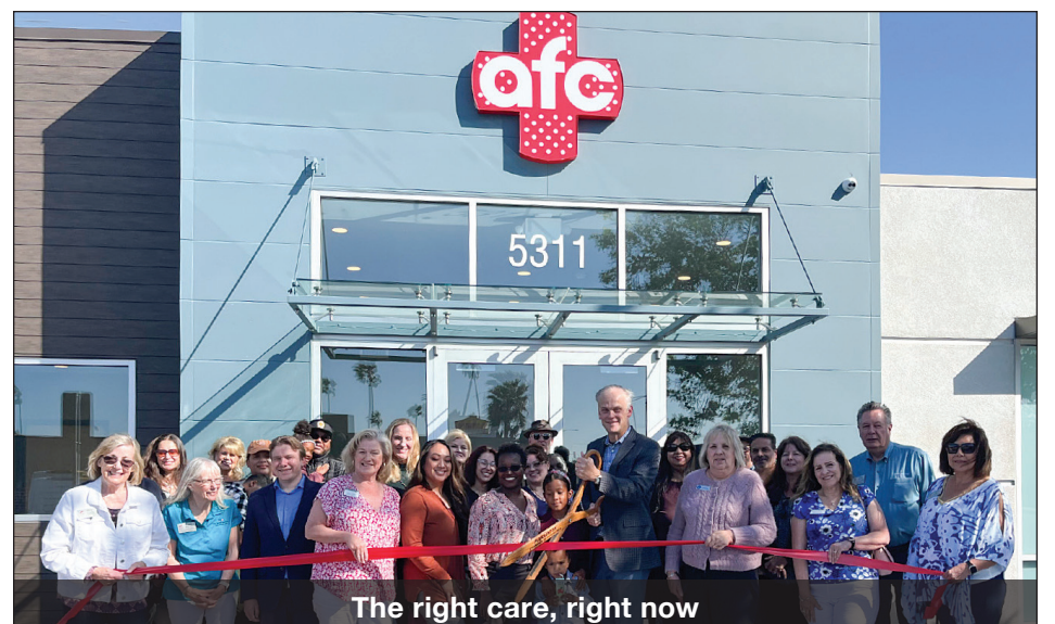
The right care, right now

Northern Curry — A great dining experience is more than just the taste; it's the sights, sounds, smells, and everything else that goes into making your visit memorable. Experience comfortable and enjoyable family dining at Northern Curry's new Pleasanton location. Northern Curry is an Indian Restaurant located at 4000 Pimlico Drive in Pleasanton and serving a wide variety of authentic North Indian Food and curries. Fresh vegetarian and non-vegetarian snacks and tandoor with dine-in, to-go, online ordering and catering options. Open Tuesday through Thursday, 11:30 a.m. to 3:00 p.m. and 5:00 to 9:30 p.m. and Friday through Sunday 11:30 a.m. to 9:30 p.m. Learn more by visiting their website www.northerncurry.com .