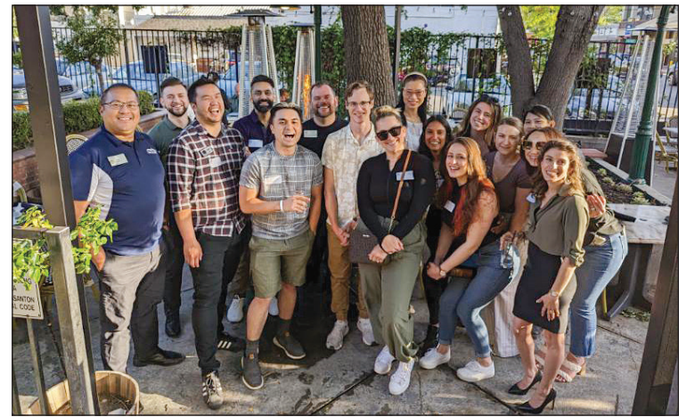
The Pleasanton Young Professionals at a monthly mixer earlier this summer at Oasis Wine Lounge in downtown Pleasanton.