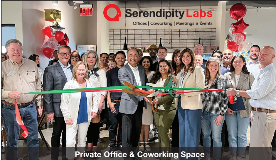
Private Office & Coworking Space

Serendipity Labs Dublin - Pleasanton — Serendipity Labs is a flexible office space company that develops and operates its upscale coworking brand as an outsourced workplace service in the U.S. and U.K. Its hub and spoke network of locations offers highly hosted workplaces that cater to the needs of the knowledge workforce with private offices, coworking, meeting and event facilities, and all-access Worktopia™ memberships. Companies of all sizes use Serendipity Labs for outsourced workplace solutions. Serendipity Labs Dublin - Pleasanton is a newly renovated building, conveniently located at the intersection of I-580 and I-680 in Dublin. Learn more at serendipitylabs.com .