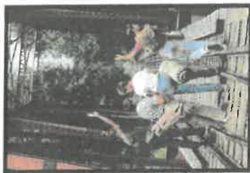
Stand By Me—Train trestle was converted and is now a foot bridge on the Row River Trail.