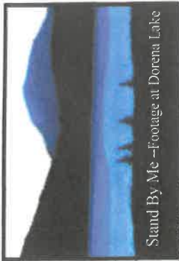
Stand By Me—Footage at Dorena Lake