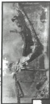
The General—this famous scene was shot in one take just upriver from the old Bohemia Mill Site. Now the parking lot at the end of the Row River Trail.