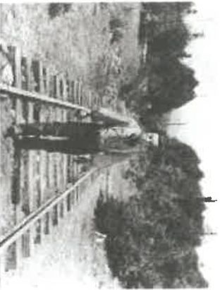
Buster Keaton on the RR tracks during the filming of The General .