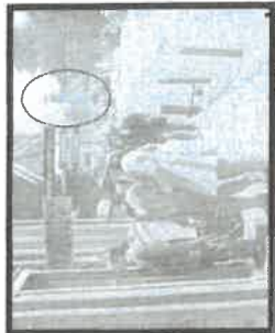
The General—This scene looks north along River Road just north of the Silk Creek Bridge.