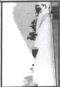
Emperor Of The North—Scene from the train near rocky point on the Row River.