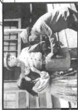
The General—Several building facades were erected at 14th and Main.