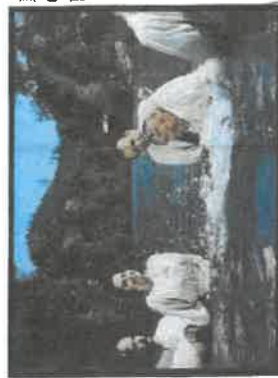
Emperor of the North—Many Cottage Grove residents were used as extras in this baptism scene shot in the Row River.