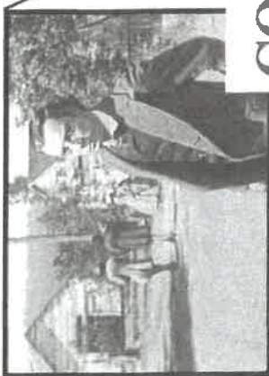
The General—On River Road, the Old Mill Feed Store is in the background.