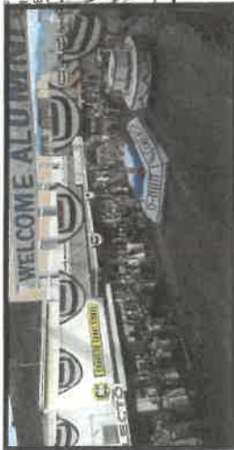
Animal House—The very destructive parade scene was filmed on Historic Main Street.