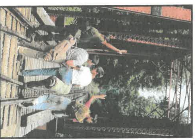
Stand By Me —Several Scenes filmed around Dorena Lake.