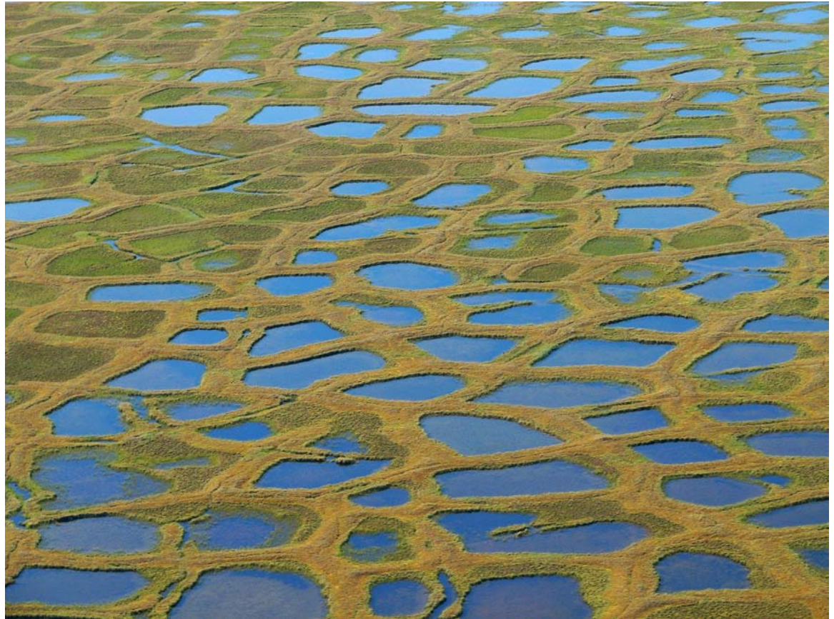
Figure 1: Polygonal Tundra Peatland in the Lena River Delta, Russia

mechanism with which Sphagnum outcompetes other species in natural systems (van Breemen 1995). Restoration projects, though, often have difficulty (re-)establishing Sphagnum species (Rochefort 2000) due to pre-existing (degraded) water levels, species selection, nutrient conditions, and competition from birch trees. Knowledge on the ecology of peatland species interactions, especially within- Sphagnum interactions, is still evolving (Andersen et al. 2011), and so there is still considerable space for erroneous predictions of manipulation effects.