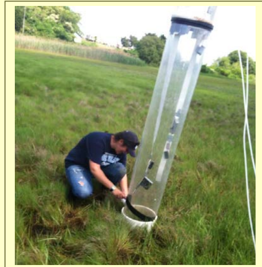
Adjusting base and chamber used for GHG flux analysis

Salt marshes are important carbon (C) sinks due to high levels of productivity, slow decomposition, and minimal emission of the greenhouse gases (GHGs) carbon dioxide (CO 2 ) and methane (CH 4 ). While this ecosystem service is well known, patterns of salt marsh C cycling are less well understood. Generally, New England salt marshes are characterized by vegetation zones that reflect gradients in edaphic stress and interspecific competition, and so GHG fluxes between zones may differ. Further, responses of these zones to anthropogenic impacts such as eutrophication may vary, with implications for responses of marsh C cycling to drivers of global change. The objectives of this experiment were to characterize GHG fluxes along a New England marsh vegetation-defined gradient, and to test responses of different vegetation-defined zones to nitrogen enrichment. Using a cavity ringdown spectroscopy (CRDS) gas analyzer (Picarro Labs), GHG fluxes were measured from 5 plots along a transect spanning 5 vegetation communities including S. alterniflora , S. patens , Phragmites , and the transition areas between each zone. On 3 measurement dates, GHG fluxes were measured pre- and post- enrichment with pulses of nitrogen-enriched seawater (500 mL of 300 μM KNO 3 ). CO 2 fluxes varied significantly between vegetation zones, with substantially more CO 2 uptake at plots with greater ameliorated