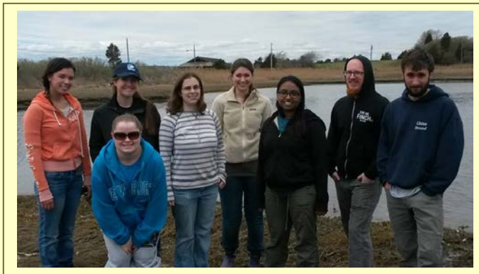
URI Student Chapter leading a marsh exploration field trip at Portsmouth High School