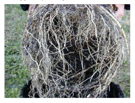
Figure 2. Root growth can be substantial and contribute to vertical soil building.

Thus, CO_2 may positively affect plant responses important for vertical soil building and may help prevent wetlands from being overtopped by rising seas.