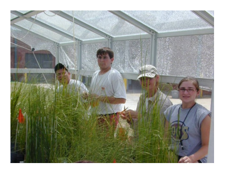
Figure 7. Collection of plant data from mesocosms in the greenhouse study.

Experiments designed to investigate the effects of CO_2 on coastal wetlands have the potential to contribute a great deal to our understanding of wetland responses to climate change. Results of studies to date reveal that CO_2 can stimulate plant production and vertical soil building, but the extent of this response will vary depending on the types of plants and the other environmental conditions in the wetland. Because multiple factors interact to influence plant responses in nature, there is still a lot to learn about the effects of elevated CO_2 on coastal wetlands and their capacity to keep pace with sea-level rise.