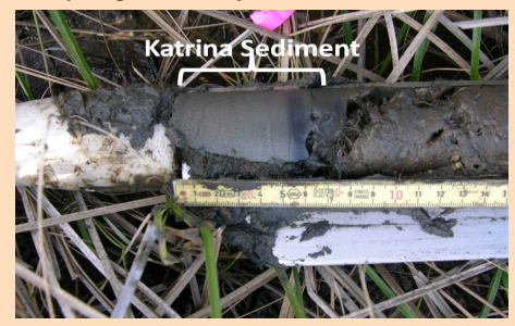
Hurricanes can deposit sediment that vertically expands soil surfaces, as observed in some wetlands after Katrina .

Coastal wetlands protect us from the damaging effects of hurricanes by absorbing wave energy and retaining flood waters. However, these storms may also affect the capacity of coastal wetlands to counterbalance sea-level rise. Hurricanes can scour and erode wetland soils, or cause flooding or saltwater intrusion that is stressful to plant communities. Under these circumstances, hurricanes may negatively affect vertical soil building by reducing or removing plants and sediment. Conversely, hurricanes can introduce nutrients and sediments to coastal wetlands in the storm surge. This input of nutrients and sediment may enhance vertical soil building by stimulating plant growth and directly adding sediment to the soil surface (see below). Whether positive or negative effects prevail depends, in part, on the strength and path of the storm. As climate changes, the strength of these hurricanes may also change, which could have significant effects on our coastal wetlands and their ability to protect us from severe storms.