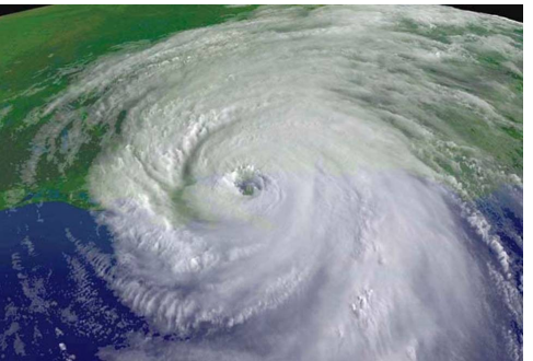
Hurricane Katrina, August 29, 2005