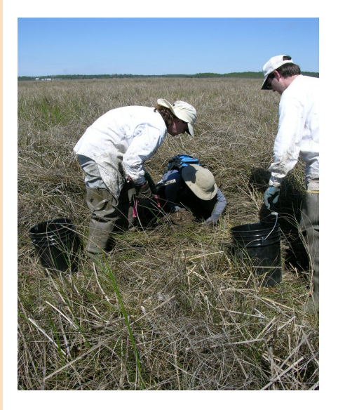
Figure 3. Collection of plant and soil plugs from a brackish marsh.

Nature is complex and ever-changing, with multiple environmental changes occurring at once. Wetland plants are not given the opportunity to respond to one thing at a