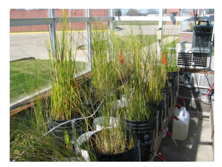
Figure 5. Mesocosms receiving elevated CO<sub>2</sub> in the greenhouse study.

Once transported back to the greenhouse, the plugs of wetland plants and soil were placed in containers called mesocosms (Fig. 5) and exposed to either ambient CO_2 levels or elevated CO_2 levels (twice as high as current levels). They were also randomly assigned to a range of salinity levels (fresh to higher than normal), and water levels (drained, intermittently flooded, and constantly flooded). We then measured plant growth and rates of soil building (Figs. 6, 7) for the different combinations of environmental conditions.