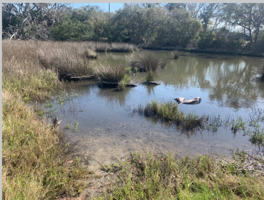
Spring in coastal marshes, Jekyll Island, Georgia, USA. Parade of fiddler crabs in the foreground.

Another big change on the horizon concerns AMPED, our long-time business office and partner. They are ending the contract with SWS early. After September 1, 2021, AMPED will no longer provide business services to the Society. Our goal is to keep everything running as smoothly as possible, but there may be a few minor bumps in the road during this transition period. Your patience is much appreciated and, as always, don't hesitate to contact me or other members of the Executive Board if you have problems, questions, concerns, or feedback. We are in the process of reviewing our governance model and also drawing up a new request for proposals (RFP) to find our next business office partner. Although a challenging phase, it is also a time for capitalizing on new opportunities, and continued growth and evolution of SWS. ■