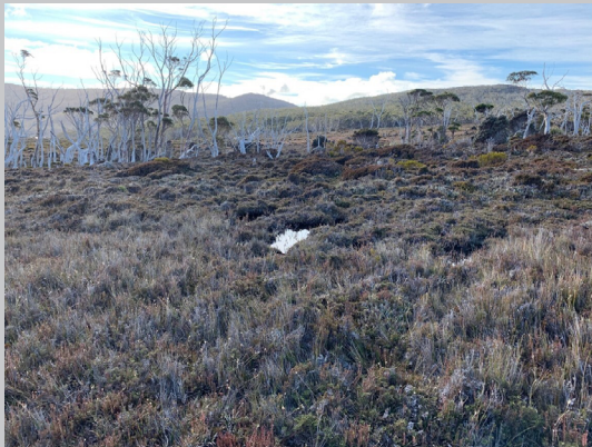
Autumn in high elevation peatlands, Mt. Field, Tasmania, Australia. Note the Tasmanian snow gums forming the tree line.

symptoms and allowing for adaptation as external factors change and uncertainties arise. In other words, moving from the use of simplified concepts and techniques, and instead simplifying the process and the project, and relying on nature to take the lead. Project examples from the Meadowlands will illustrate practical restoration approaches that have proven successful in restoring wetland services and functions over time. ■