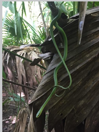
Spring in floodplain forest, Jean Lafitte National Historical Park & Preserve, New Orleans, Louisiana, USA. Rough green snake on palmetto.