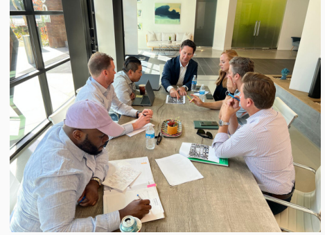
YPG team working on their Capstone Project