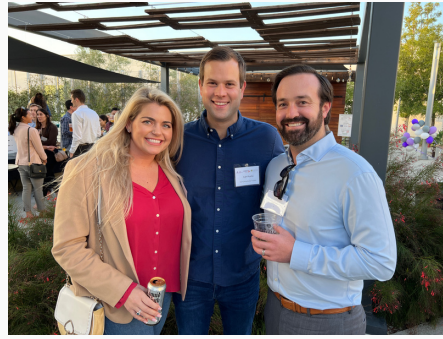
YPG/Crew/ULI Mixer: Party Like It's 2019!