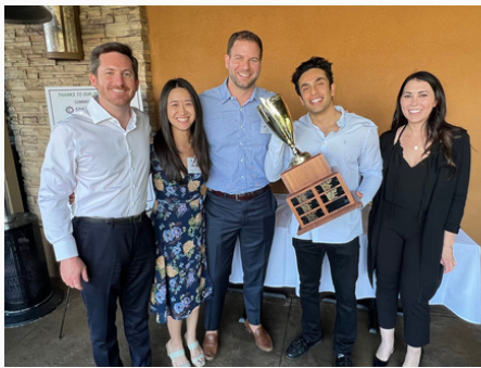
YPG 2022-2023 Case Competition Winners

The Young Professionals Group (YPG) is NAIOP SoCal's industry-leading professional development and leadership program. Each year, 35 real estate professionals are selected to take part in a 12-month, 70-hour course designed to educate, develop, connect and elevate the industry's emerging leaders. The program offers instruction on critical components of the industry, personal and professional development coaching from MBA-level instructors, extensive networking and relationship-building activities, and guidance from executives through an intimate speaker series.